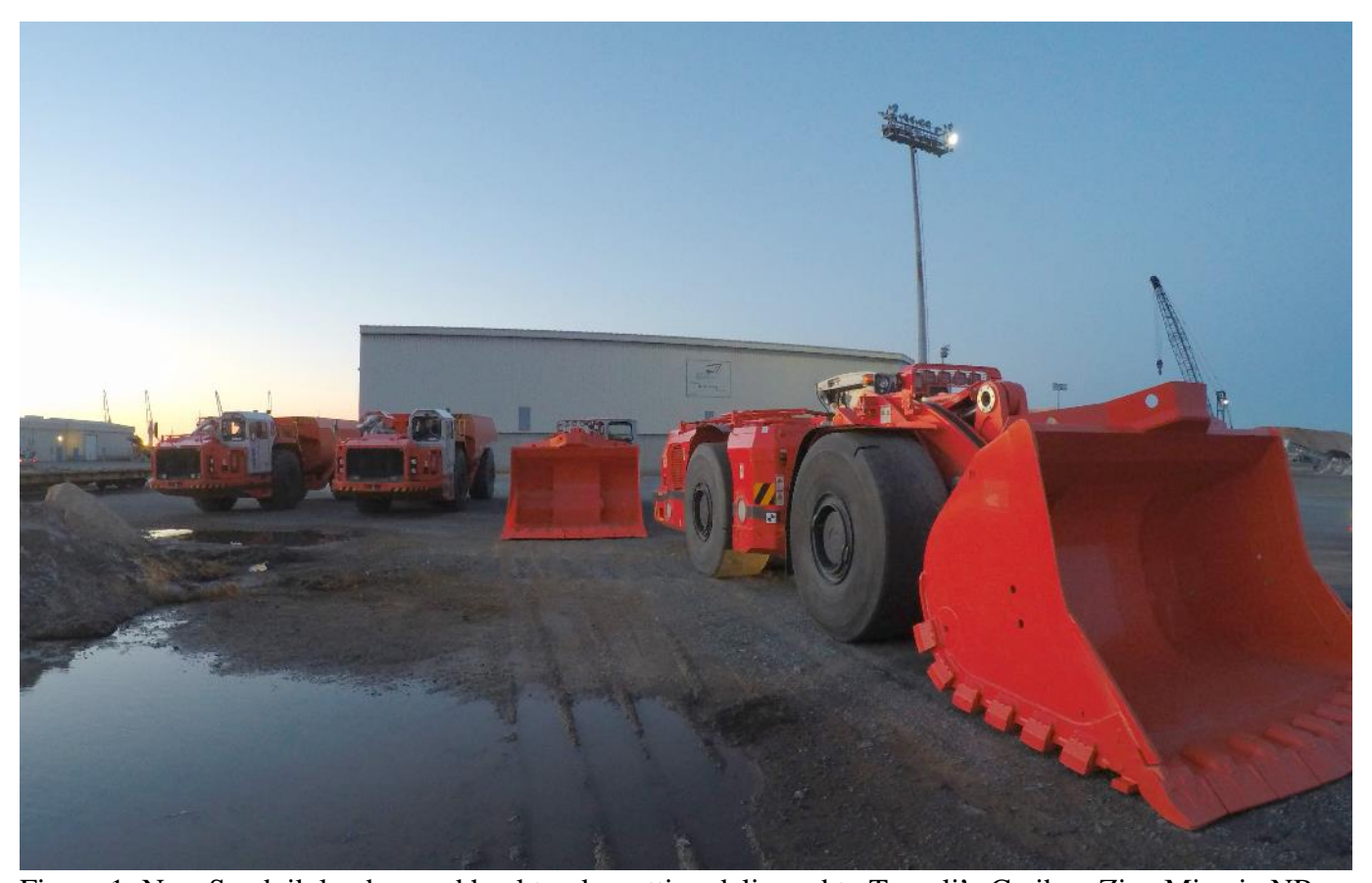
Figure 1: New Sandvik loaders and haul trucks getting delivered to Trevali's Caribou Zinc Mine in NB.

Vancouver, British Columbia: Trevali Mining Corporation ("Trevali" or the "Company") (TSX: TV, BVL: TV; OTCQX: TREVF, Frankfurt: 4TI) announces it has received initial delivery of part of its new Sandvik underground mining fleet for the Caribou Zinc Mine in the Bathurst Mining Camp of northeastern New Brunswick. Components of the new fleet, specifically new haul trucks and loaders, have arrived as scheduled and are currently being transitioned into operations where they are expected to deliver higher availability and production performance upon integration (Figure 1).