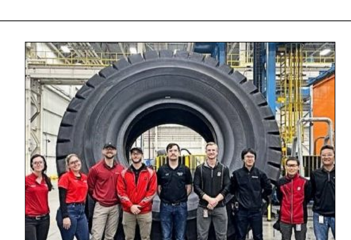
Bridgestone begins US production of its largest MasterCore tyres at Aiken