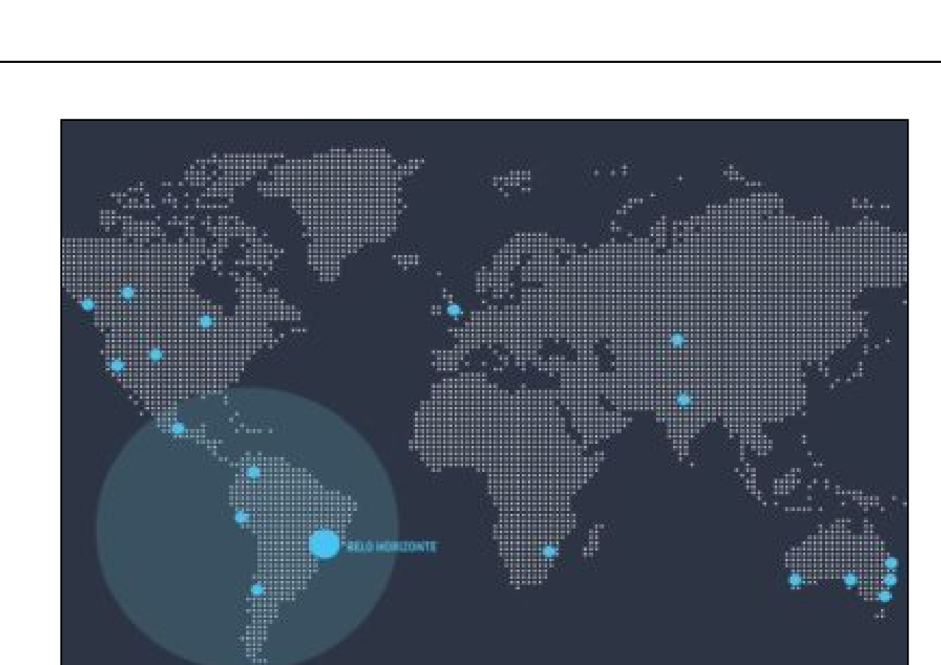
Sandvik acquires MCB, strengthening Deswik's position in Latin America