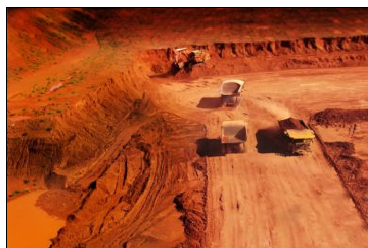
ASI Mining goes commercial with autonomous haulage system