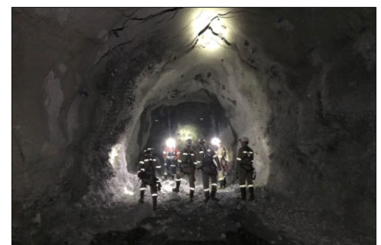
Nevada Copper drafts in Dumas Mining as part of Pumpkin Hollow restart plan