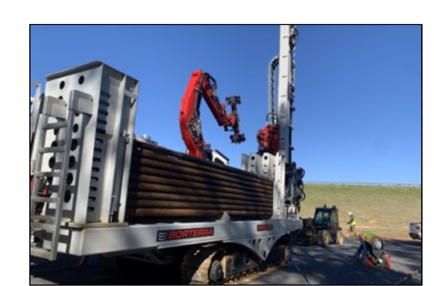
Borterra says RodBot™ robotic drill-rod handling supercharges productivity and boosts safety