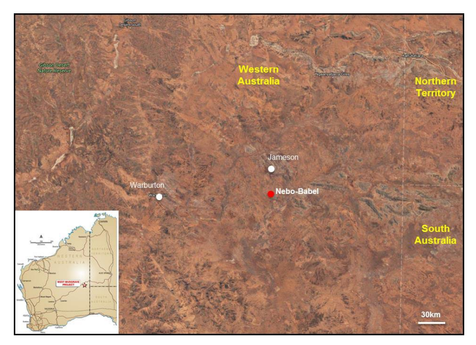
Figure 1: West Musgrave Project Location

The West Musgrave 2019 Mineral Resource Statement relates to an updated Mineral Resource estimate for the Nebo and Babel nickel-copper deposits, located within the West Musgrave Project area in Western Australia that were discovered by WMC Resources in 2000. The deposits are located approximately 1,300 kilometres northeast of Perth near the border with South Australia and the Northern Territory (Figure 1). The Nebo Deposit (Nebo) lies approximately 1.5 km northeast of the Babel Deposit (Babel) (Figure 2). Independent models were created for each deposit.