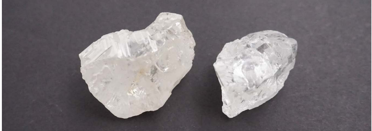
84 carat Lulo gem (right) recovered during the Quarter and 117 carat gem (left) recovered post-Quarter

The full fleet of new earthmoving equipment was operational at Lulo throughout the Quarter. This new Volvo and Caterpillar fleet – comprising six excavators, eight trucks, two tracked dozers and a wheel dozer - is part of a US$12m SML-funded expansion of the alluvial mining operations which is planned to deliver a ~50% increase in carat production in 2020 (Refer Group diamond production growth section).