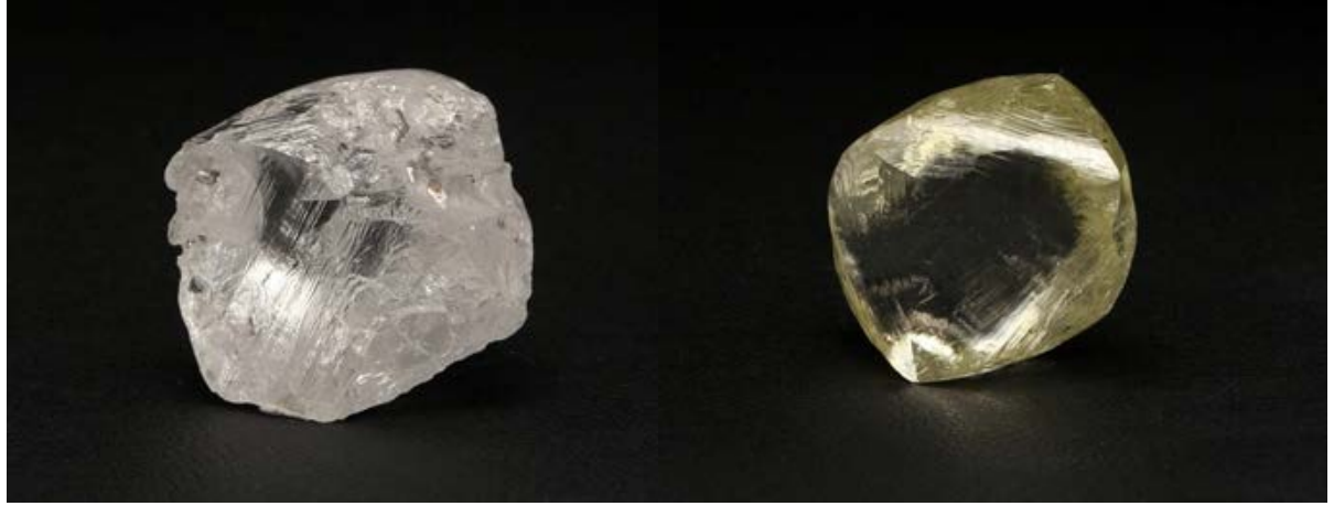
Gem-quality Mothae diamonds sold during the Quarter – 25 carat white and 22 carat yellow

Table 1: Mothae treatment and recovery results