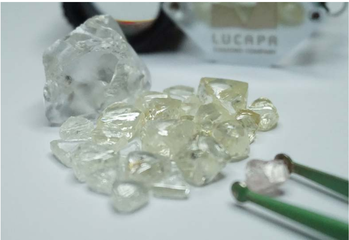
Selection of Lulo diamonds sold during the Quarter