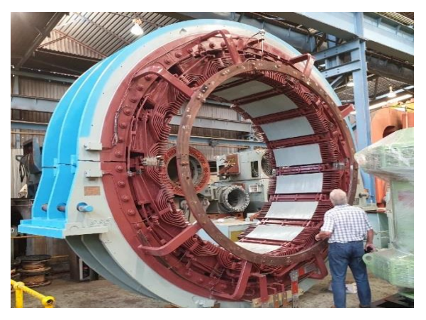
Shaft winder repairs (armature)

The project team has also commenced the final issue for construction (IFC) drawings to support the major contracts tender and award processes.