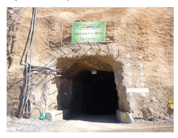
Decline access to the Odysseus mine

Ventilation lateral and vertical development is ongoing with completion of the DORA rise (connecting back into the open pit) and the development of the mid-shaft access decline. Pilot hole drilling has been completed for two new vent rises, with partial reaming complete. These airways are a critical component of the ventilation infrastructure for mining the Odysseus orebody.