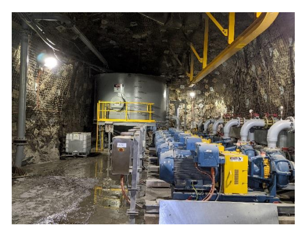
Fully commissioned underground pump station