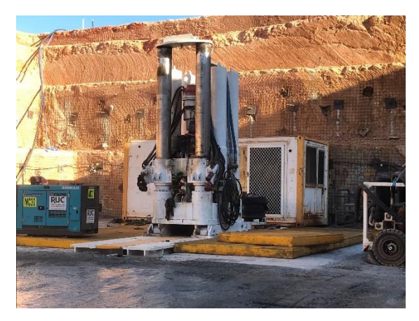
Raisebore on the fresh air intake/hoisting shaft collar