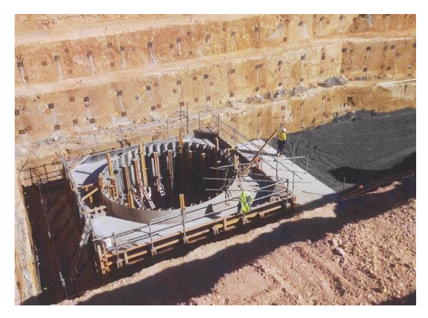
Shaft sub-brace concrete structure complete

Civil construction work is ongoing with the completion of the shaft box cut excavation and the commissioning of the batch plant, necessary for the concrete foundation works. Construction of the shaft sub-brace concrete slab is complete, as well as the RUC "sacrificial" foundation. Pilot hole drilling preparation work is now advancing for Stage 1 of the 5.7m diameter hoisting shaft, which is scheduled to commence in mid September. The Stage 1 pilot hole will be drilled to a depth of 645 meters, enabling it to hole into the mid-shaft access decline. This will be followed by the reaming of the 5.7m diameter shaft back to surface.