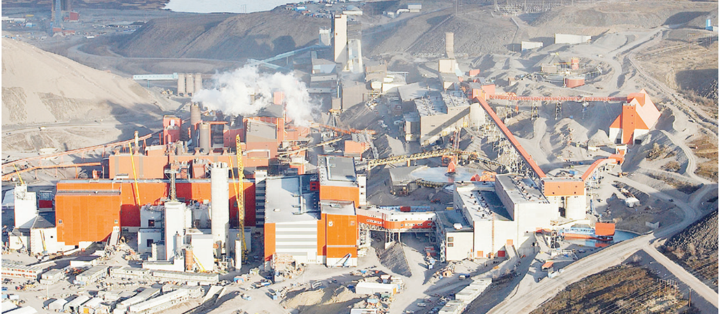
LKAB Kiruna mine

ABB delivered its first complete mine hoist in 1937. Since then, more than 600 units all over the world have been installed. High speed and heavy loads with high safety and performance, demand advanced technology for drive, control and brake systems. Qualified maintenance personnel and fast access to competence is necessary to maintain high safety, high performance and availability. ABB offers mine hoist services for condition and performance control to maintain the equipment in the “as commissioned” condition.