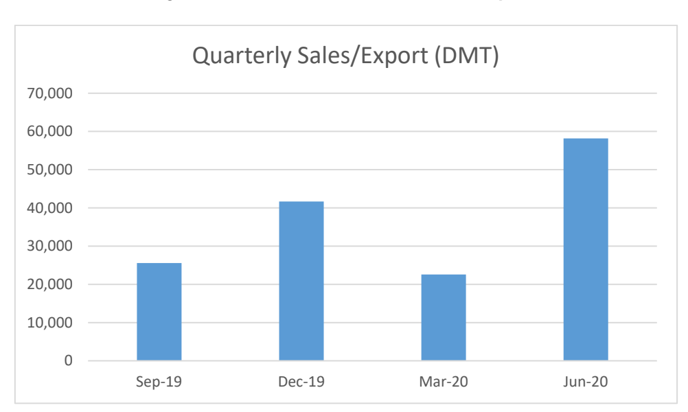
Figure 2 – Altura Lithium Concentrate Exports

Altura continues to receive positive feedback from customers on the high-quality nature of the Company's product. The mineralogy and product handling characteristics all deliver excellent performance in the manufacturing of battery-grade lithium chemicals.