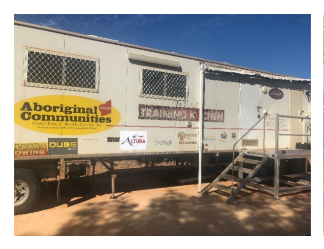
Figure 3 – Warralong and Strelley cold food storage unit and kitchen facilities

Altura also donated sporting equipment to the Strelley Community School, which with the cold food storage unit will assist with the school's existing healthy living program.