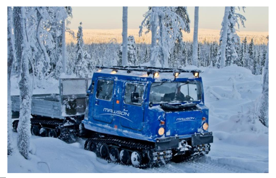
mage by Mawson Gold