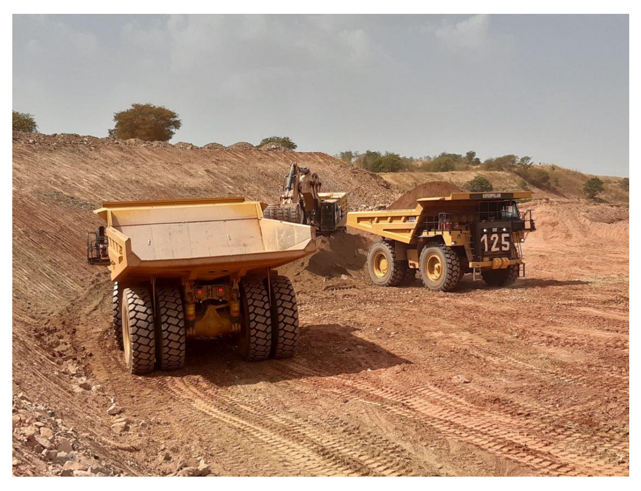
Figure 1. Mining Operations at Morila Pit 5.

Mining is underway at Morila Pit 5 (Figures 1 & 2), a mining area located on the western margin of the Morila Super Pit (Figure 3). Malian owned and operated contractor EGTF have mobilised a new 100 tonne class fleet, completed all mining preparatory works including re-establishment of the haul road to the crushers, and commenced mining and haulage to the crusher run of mine (RoM) stockpiles.