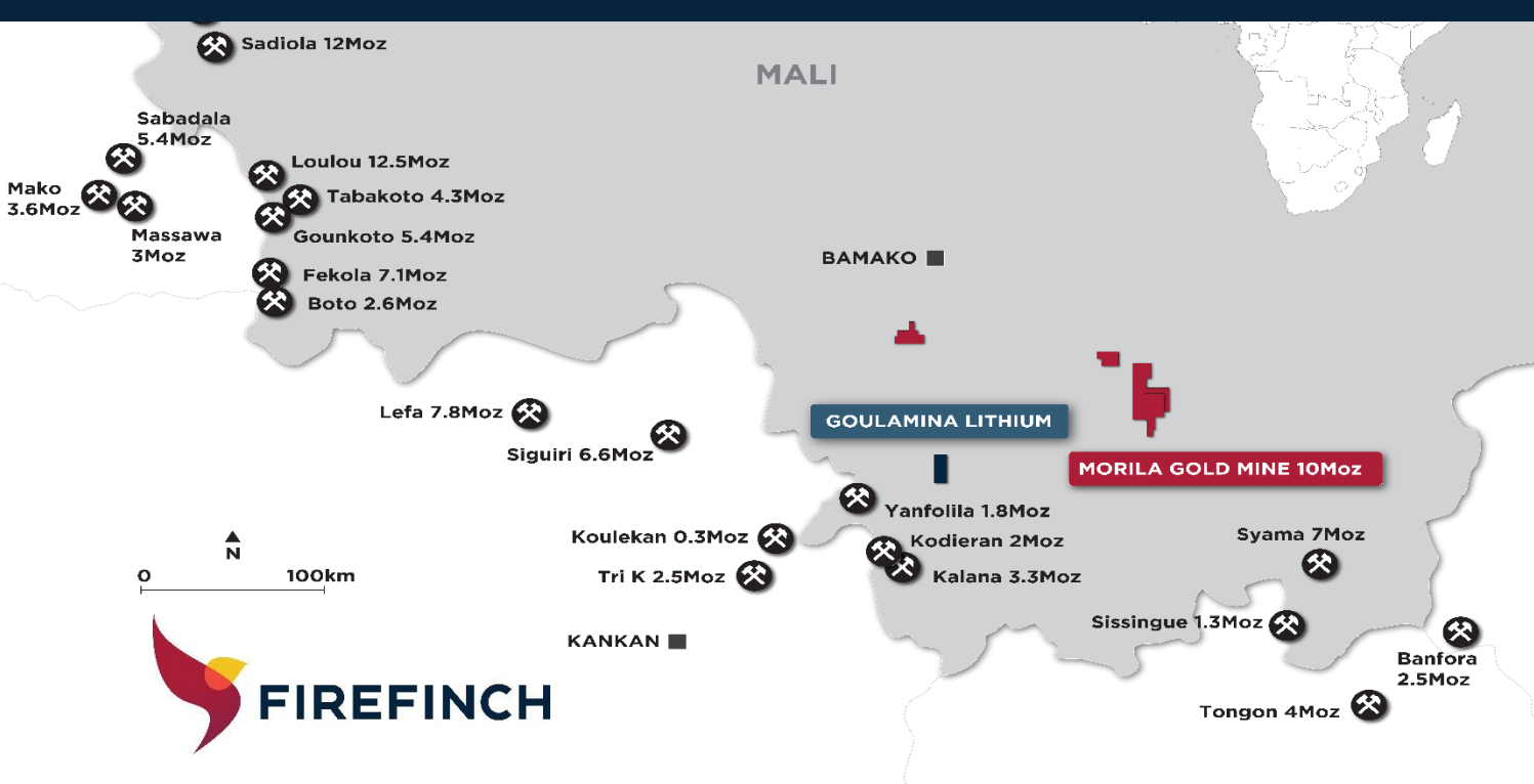
Firefinch is a Mali focussed gold miner and lithium developer. Firefinch has an 80% interest in the Morila Gold Mine and 100% of the Goulamina Lithium Project.

Morila has produced 7.5 million ounces of gold since 2000; it was one of the world's highest grade open pits some 12 to 20 years ago. Firefinch acquired the mine at a substantial discount in November 2020 with the view to increase production at the 4.5mtpa mill from a current annual production profile of 40,000 ounces of gold per annum from tailing treatment, towards a target of 70 to 90,000 ounces of gold per annum through mining of small open pits, stocks and tailings from mid-2021. In 2022, the Company plans to further increase production to target 150,000 to 200,000 ounces of gold per annum by re-commencing mining from the main Morila pit to fully exploit the 2.43 million ounces of gold in the Global Resource at Morila (Measured: 1.73Mt at 0.5g/t for 0.03Moz, Indicated: 26.7Mt at 1.49g/t for 1.28Moz and Inferred: 22.1Mt at 1.58g/t for 1.12Moz). A production target of 150,000 to 200,000 ounces of gold per annum has been set by the Company. Morila's geological limits are not well understood, thus exploration is a major focus at Morila, its satellite resources and multiple targets on the 685km² of surrounding tenure.