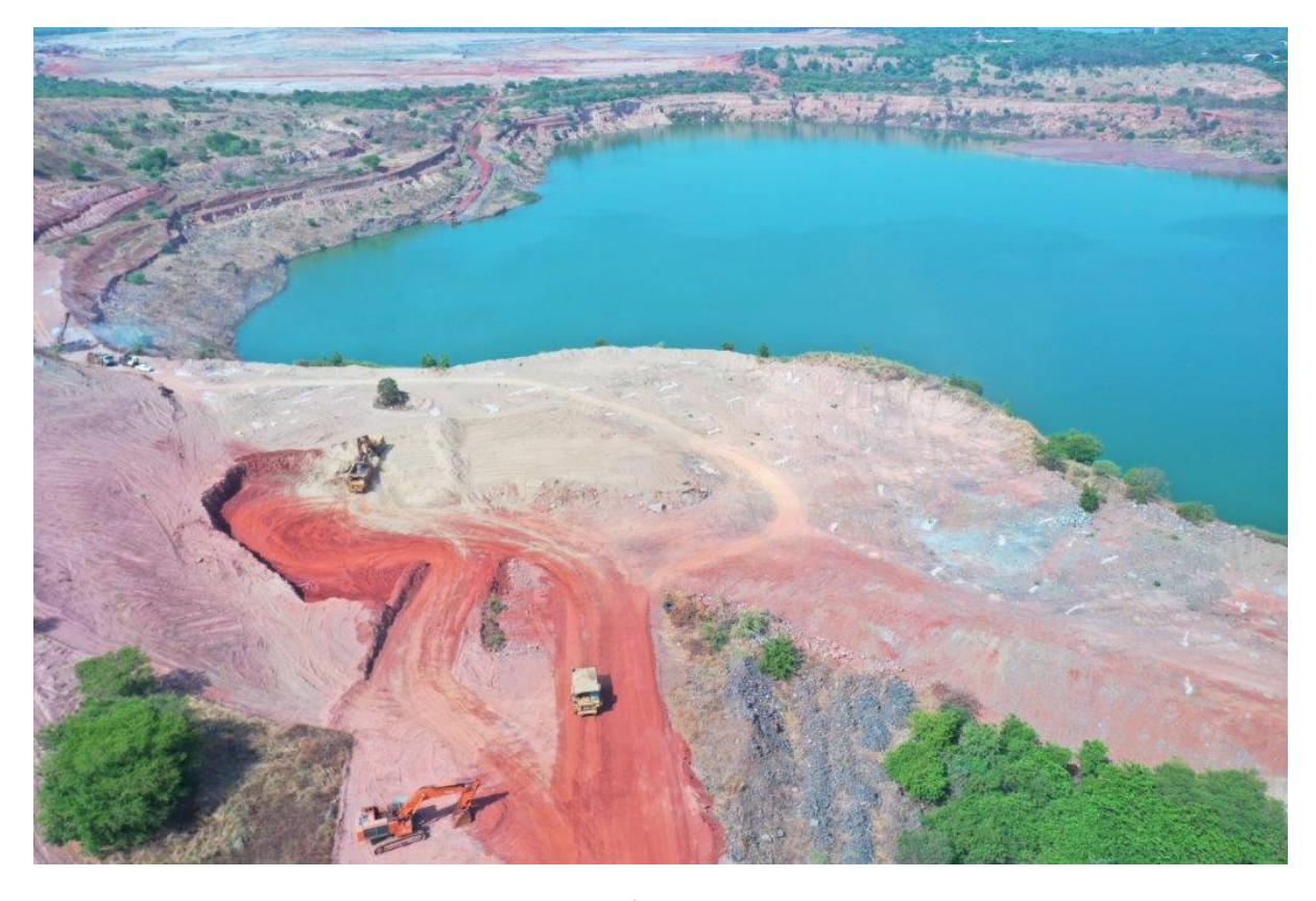
Figure 2. Aerial photograph of mining operations at Morila Pit 5.

"It is very exciting to be off and running with our first open pit mining operation at Morila. The location of Pit 5 right next to our operating processing plant, combined with recent drilling results that enhanced economics, made it a compelling opportunity to fast-track first production before we commence mining at our other satellite deposits. Importantly all the work has been undertaken safely, and it is very pleasing to have engaged the Malian owned and operated contractor EGTF, to resume mining at Morila Pit 5. Having taken these first steps, we of course remain very focussed on the main prize – bringing the Morila Super Pit back into operation."