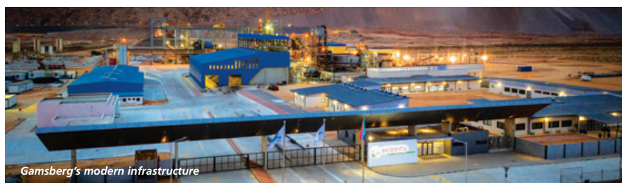
Gamsberg's modern infrastructure