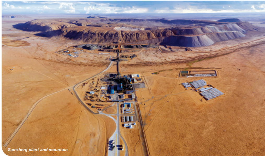
Gamsberg plant and mountain