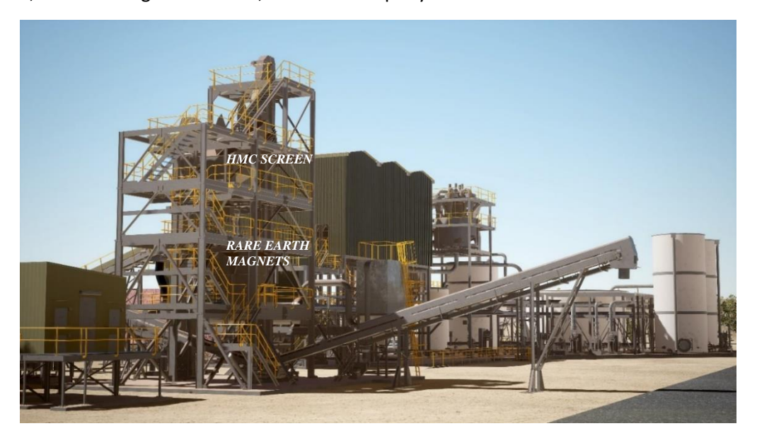
Figure 6 Lucky Bay Garnet Mine Mineral Separation Plant

The Heavy Mineral Concentrate (HMC) produced at the WCP is further processed at a Mineral Separation Plant (MSP). The HMC is dried in a rotary drier then screened and fed through a series of magnets to separate the garnet from the HMC. The remaining Fine Heavy Mineral Concentrate (FHMC) that includes the ilmenite, zircon and other HM is stockpiled for future bulk shipping to customers. The plant is designed to produce 125,000-135,000t of bulk garnet and 30,000t of FHMC per year.