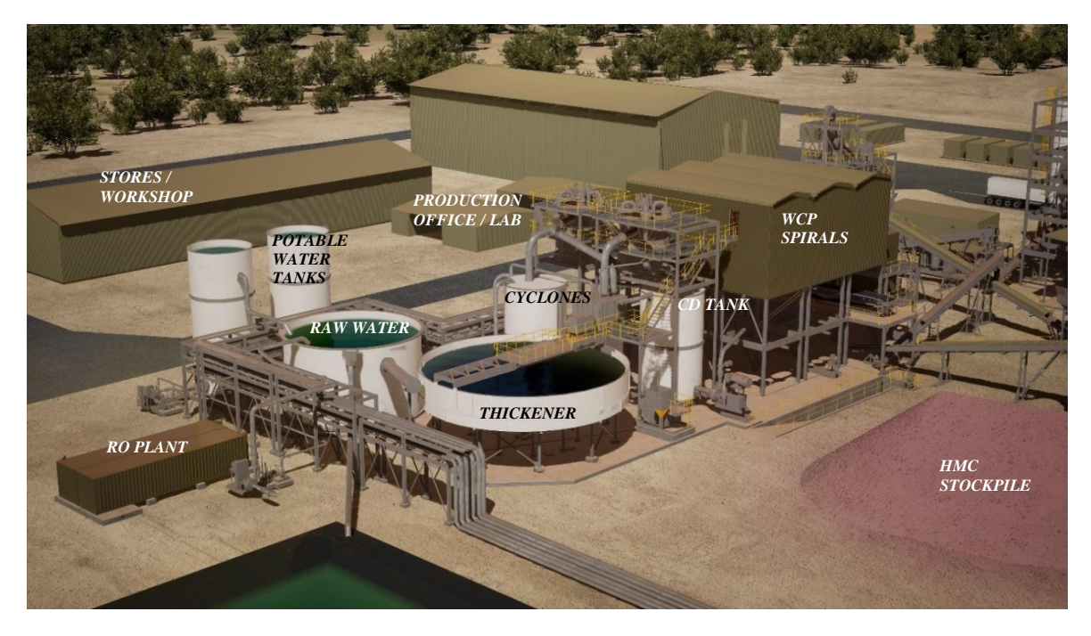
Figure 5 Lucky Bay Garnet Mine Wet Concentrator Plant

Dewatered sand tailings are returned to the mining void where they are contoured. The slimes are then blended with the sand tails before returning the stockpiled soil and vegetation material as part of the post mining rehabilitation.