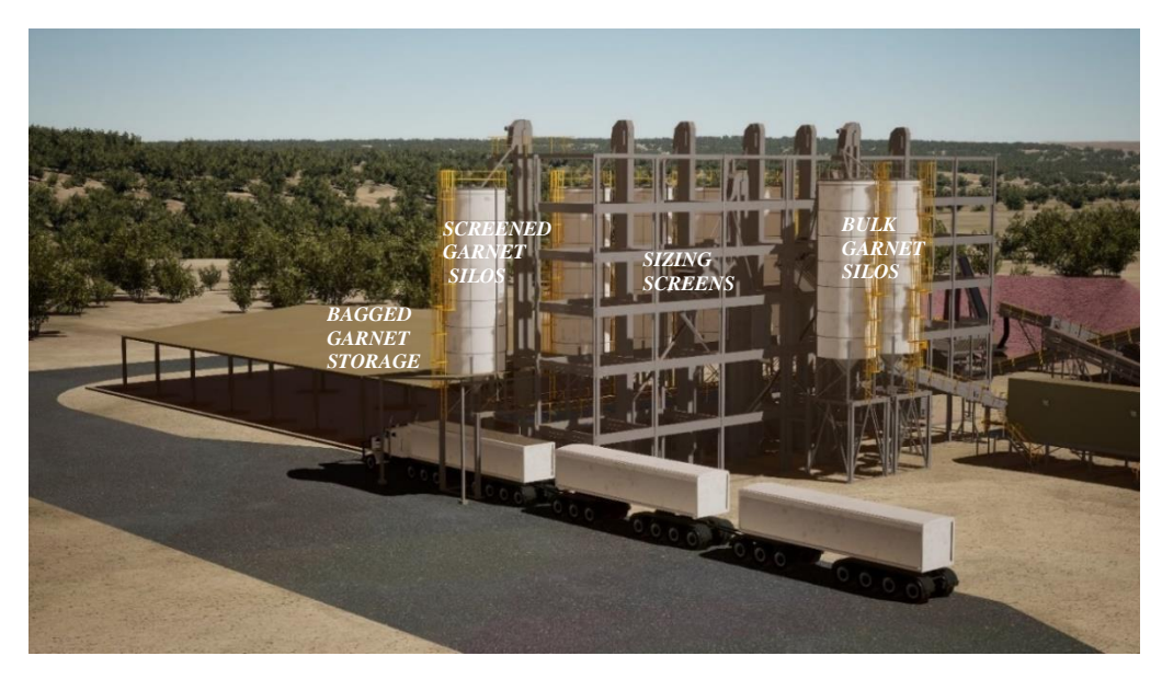
Figure 7 Lucky Bay Garnet Mine Screening and Bagging facility

The bagged products are stockpiled at site and despatched to Fremantle port where shipping containers are loaded and shipped to global distributors.