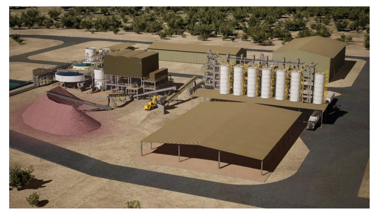
Figure 1 Lucky Bay Garnet Mine process plant layout

Initial marketing enquiries confirms strong interest in the premium garnet products that will be produced at the Lucky Bay Garnet mine, especially from distributors in Europe and North America.