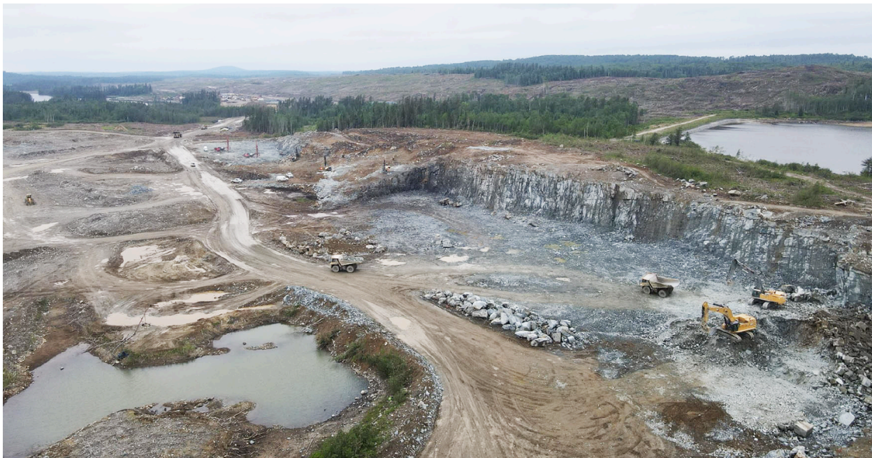
Open Pit Area