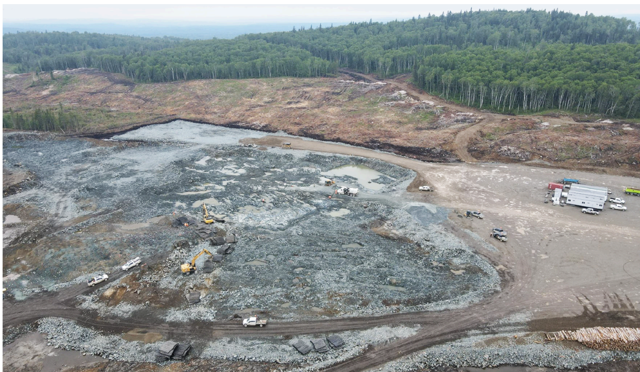
Process Plant Footprint