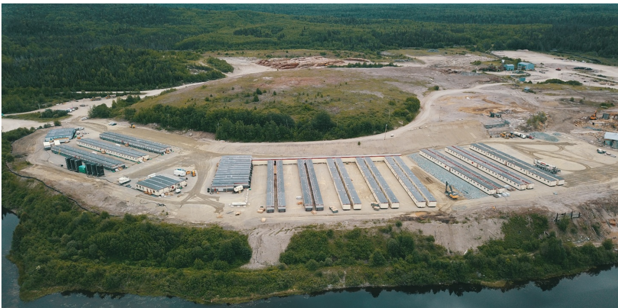
Magino Lodge – Camp, Recreation Centre and Kitchen