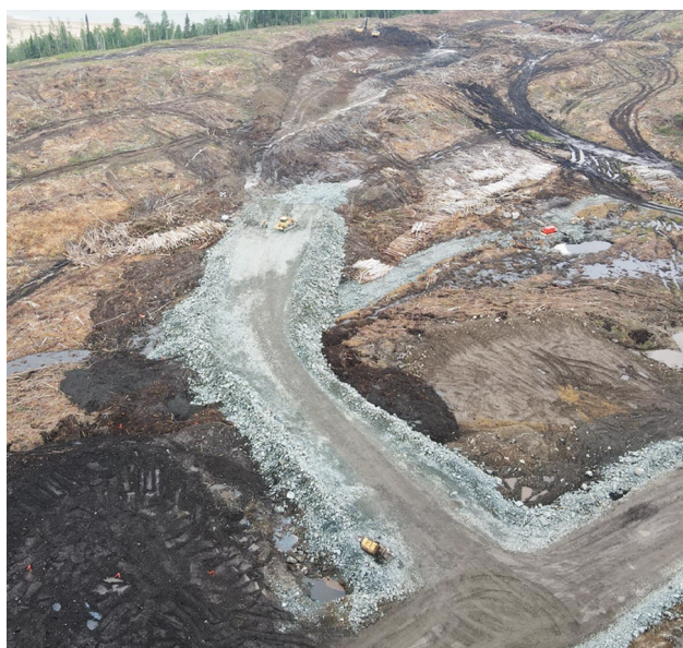
Haul Road construction in progress from Truck Shop to Run-of-Mine