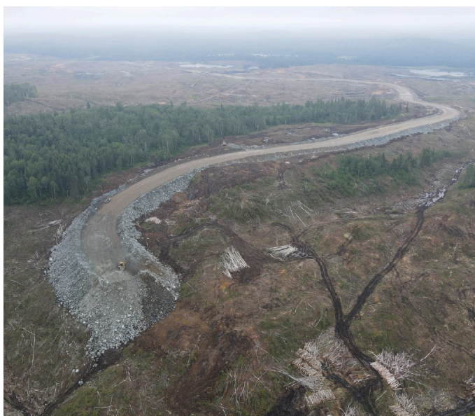
Main Haul Road completed to the TMF (shown at water control quality pond)