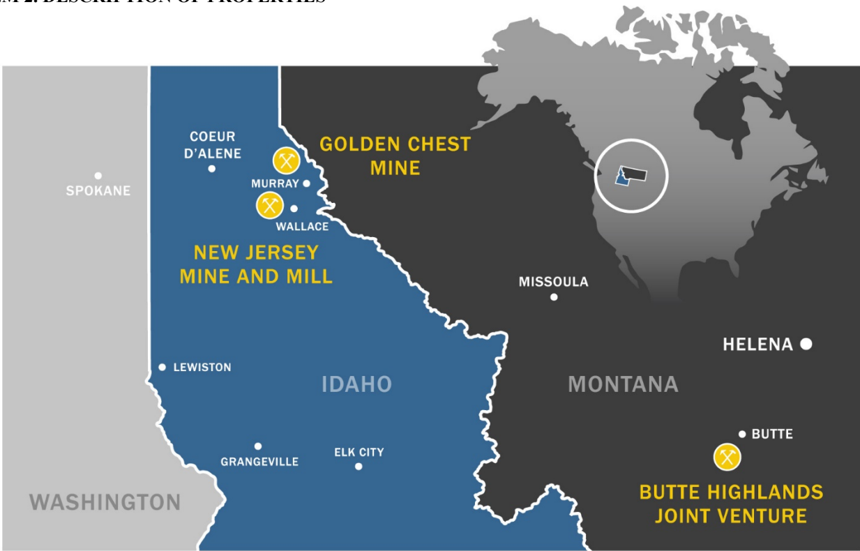
Figure 1 - Project Location Map