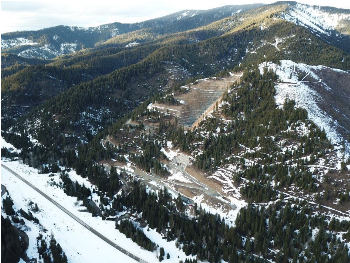
Figure 1 - Photo of New Golden Chest Mine in February 2020