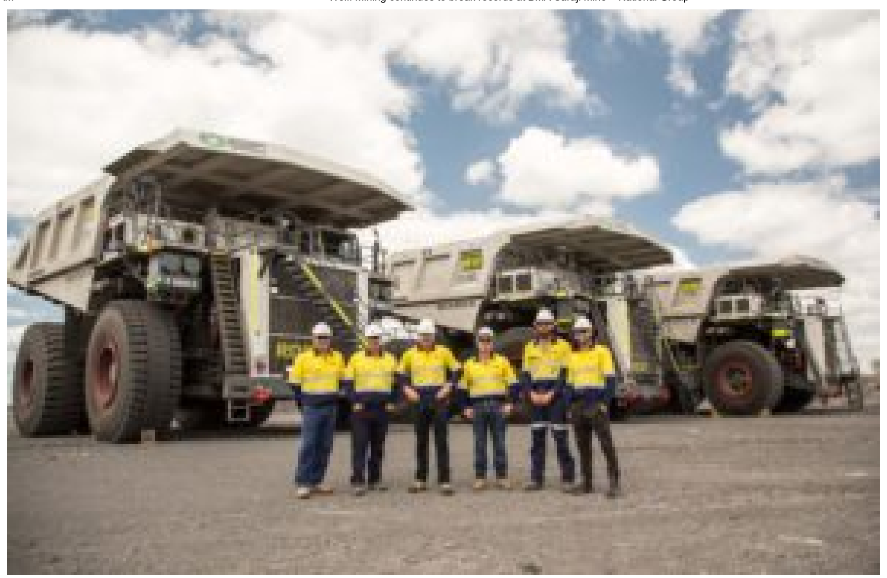
October 12, 2021

National Group announces major recruitment campaign