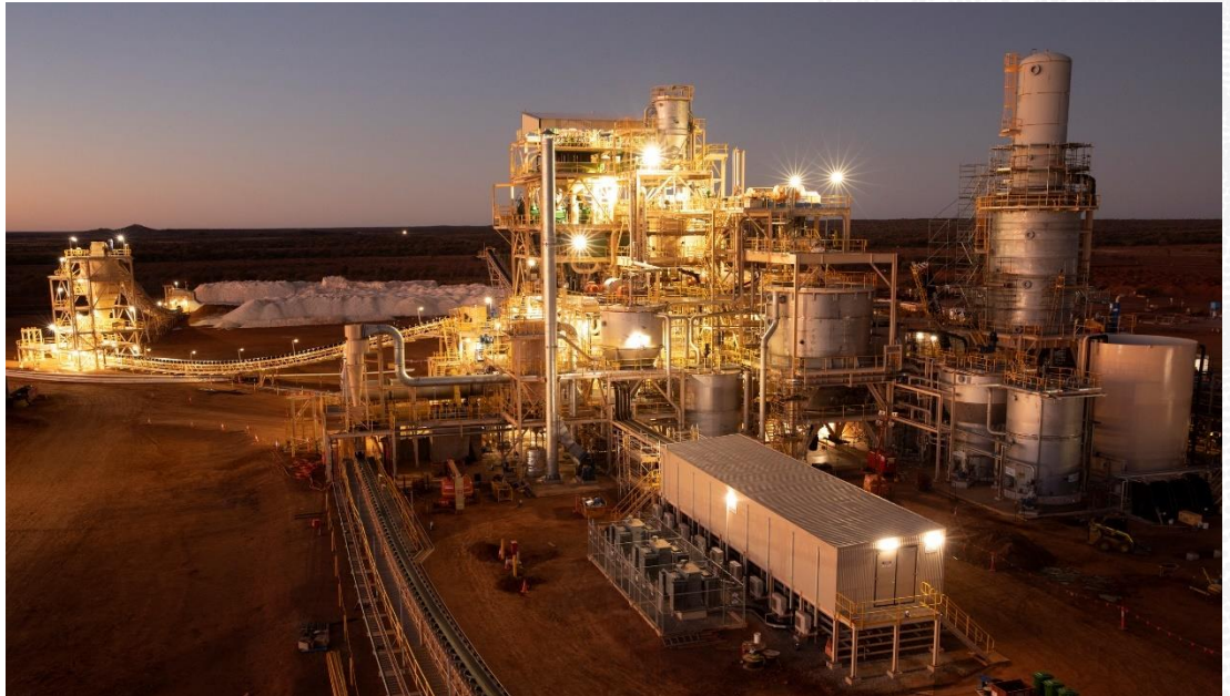
Figure 1: Process Plant and feed salts

The SO4 operations team have been systematically working through the plant to ensure each unit is functioning within design parameters and the plant chemistry is established.