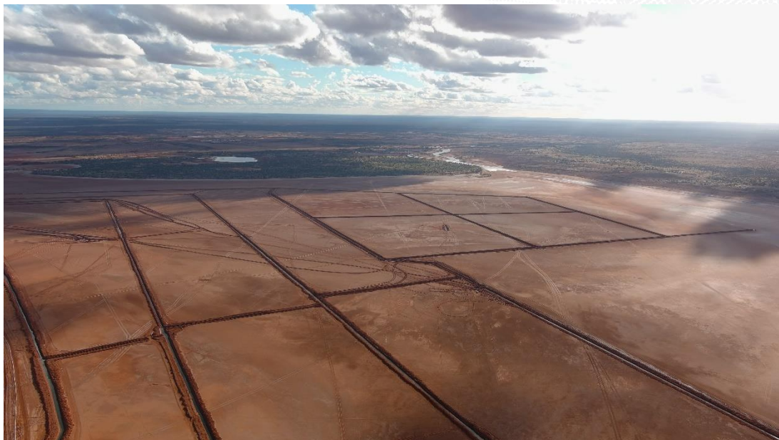
Figure 7: Northern trench network

Salt harvesting recommenced in Train 1 with the in-cell stockpiles that were harvested during the March quarter also transported to the plant. Around 90-110kt of harvest salt harvested ready as feedstock for the plant.