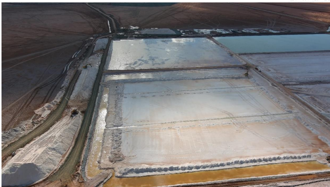
Figure 8: Train 1 cell de-brining ahead of harvest

Salt harvesting recommenced in Train 1 with the in-cell stockpiles that were harvested during the March quarter also transported to the plant. Around 90-110kt of harvest salt harvested ready as feedstock for the plant.