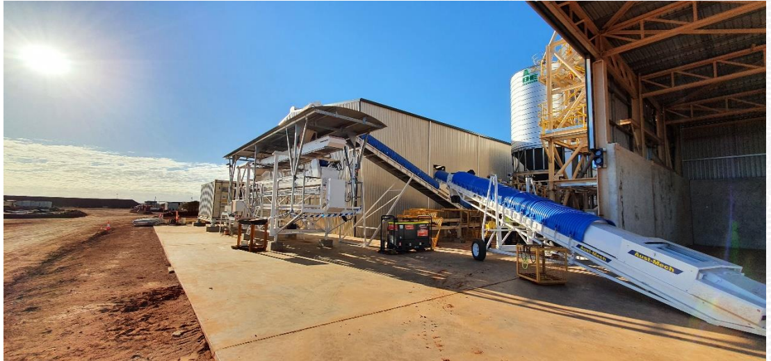
Figure 4: Bulk bagging plant

The form fill seal bagging plant installation has progressed significantly and is expected to be completed during the September quarter. The plant will bag the product into 25kg bags for export via Fremantle.