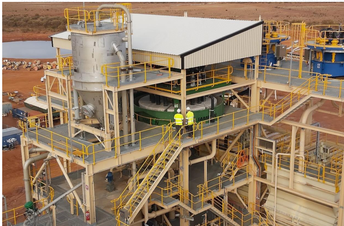
Figure 3: Process Plant flotation cell during commissioning