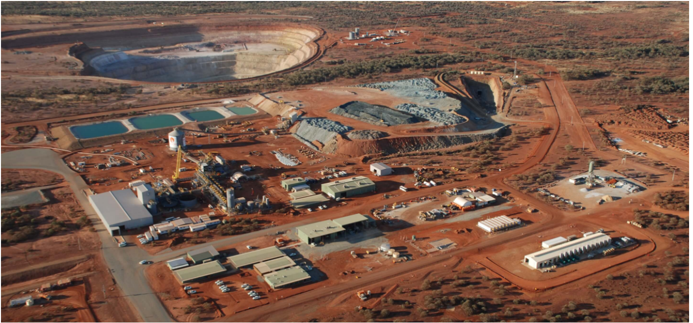
DeGrussa Copper-Gold Mine and surface infrastructure.

Production from the ultra-high-grade Monty satellite underground mine (discovered in 2015) commenced in 2019, with ore trucked 14km by road to the Concentrator for processing.