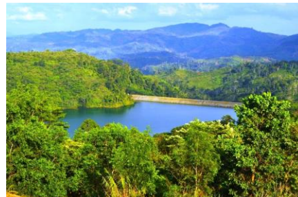
Canatuan Tailings Storage Facility – June 2020

TVI announced on November 22, 2019 that TVIRD had determined to advance Balabag towards commercial production and was progressing with various development works. This followed TVI's announcement on October 22, 2019 that TVIRD had closed an Omnibus Loan and Surety Agreement with China Banking Corporation, providing for a US $28.5 million principal amount 5-year term loan facility (the "Facility") to finance development activities at Balabag and on October 24, 2019 that TVIRD had completed its first drawdown (US $6 million) under the Facility to finance Balabag development works. On May 12, 2020, TVI announced that TVIRD had completed its seventh and final drawdown (US $6.5 million) under the Facility.