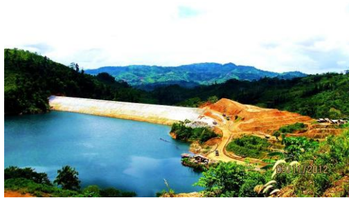
Canatuan Tailings Storage Facility – November 2012.

As at the date of this AIF, Canatuan is in the process of completing its final rehabilitation activities under the supervision of the MMT that includes members of the LGU, representatives of the local community, the municipal and provincial government, and the DENR (as representatives of the national government).