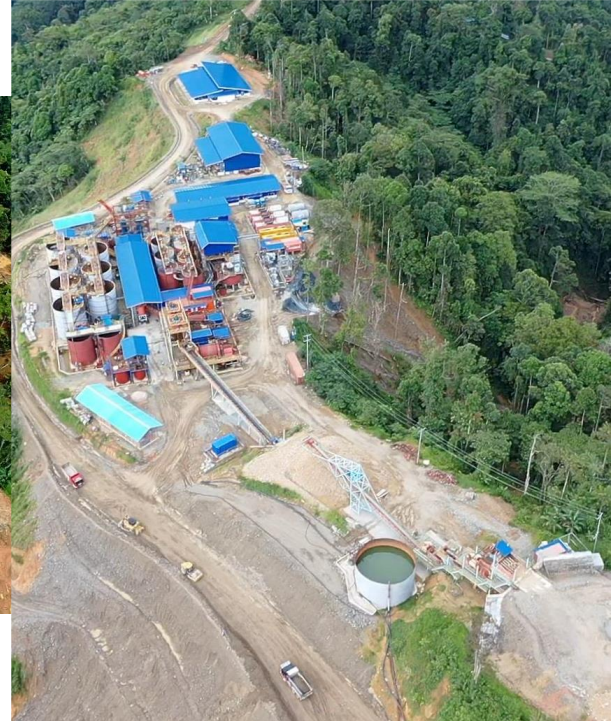
Aerial view of the Mill Plant Site of the Balabag Gold Project on February 2, 2021.