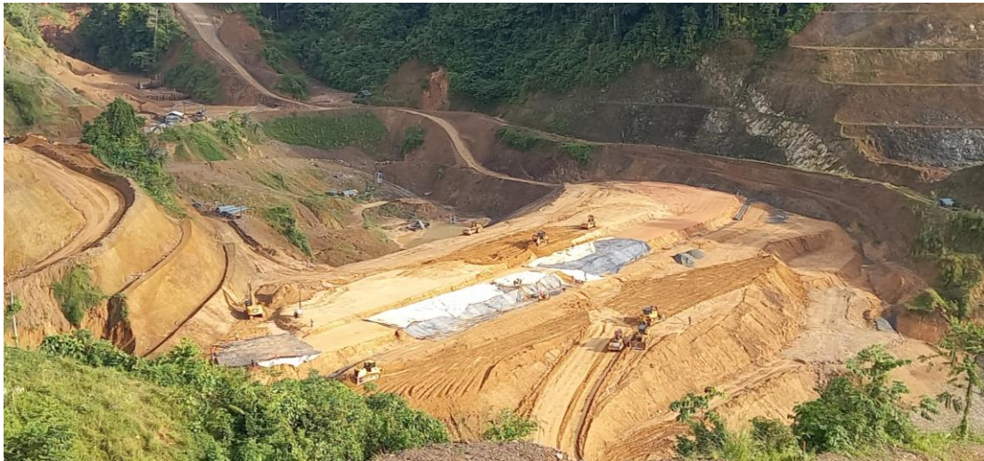
Aerial view of Tailings Storage Facility on April 20, 2021.

Project development has continued at Balabag amidst the COVID-19 pandemic as TVIRD has continued its focus to ensure that all staff are aware of and adhering to COVID-19 precautionary measures. Commissioning of the front-end circuits of the Balabag process plant was underway in December 2020 and included low grade ore being fed through the crushing area for the purpose of debugging the Mill. Debugging activities have continued in preparation for a Plant power-on and load test in March 2021. Completion of the Tailings Storage Facility remains as the critical path to bringing the Balabag Mine online with first doré production.