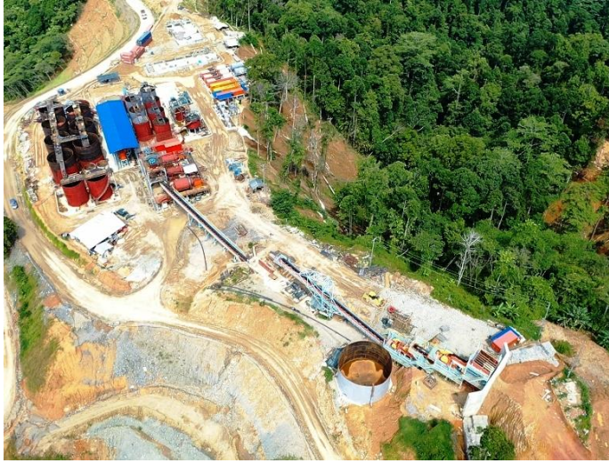
Aerial view of the Mill Plant Site of the Balabag Gold Project on May 16, 2020.