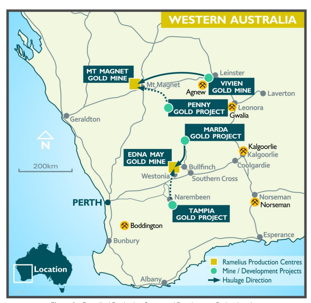
Figure 2 – Ramelius' Production Centre and Development Project locations

Ore from the high-grade Vivien underground mine, located near Leinster, is trucked to the Mt Magnet processing plant where it is blended with ore from both underground and open pit sources. The Edna May operation currently processes ore from its underground and open pit operations as well as hauled ore from the Marda gold mine.