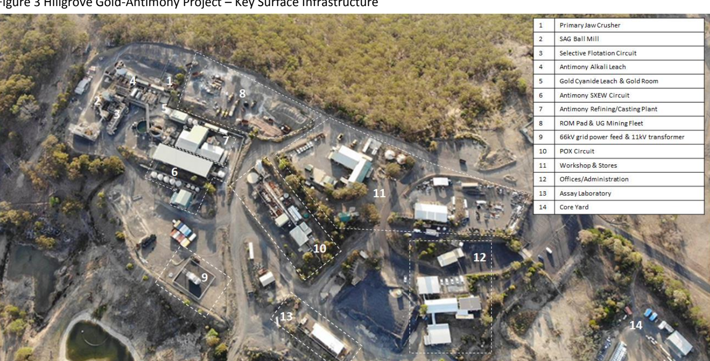
Figure 3 Hillgrove Gold-Antimony Project – Key Surface Infrastructure

A fully HDPE (high-density polyethylene) lined modern tailing storage facility which was constructed in 2006, and has approximately 2 years of production storage capacity.