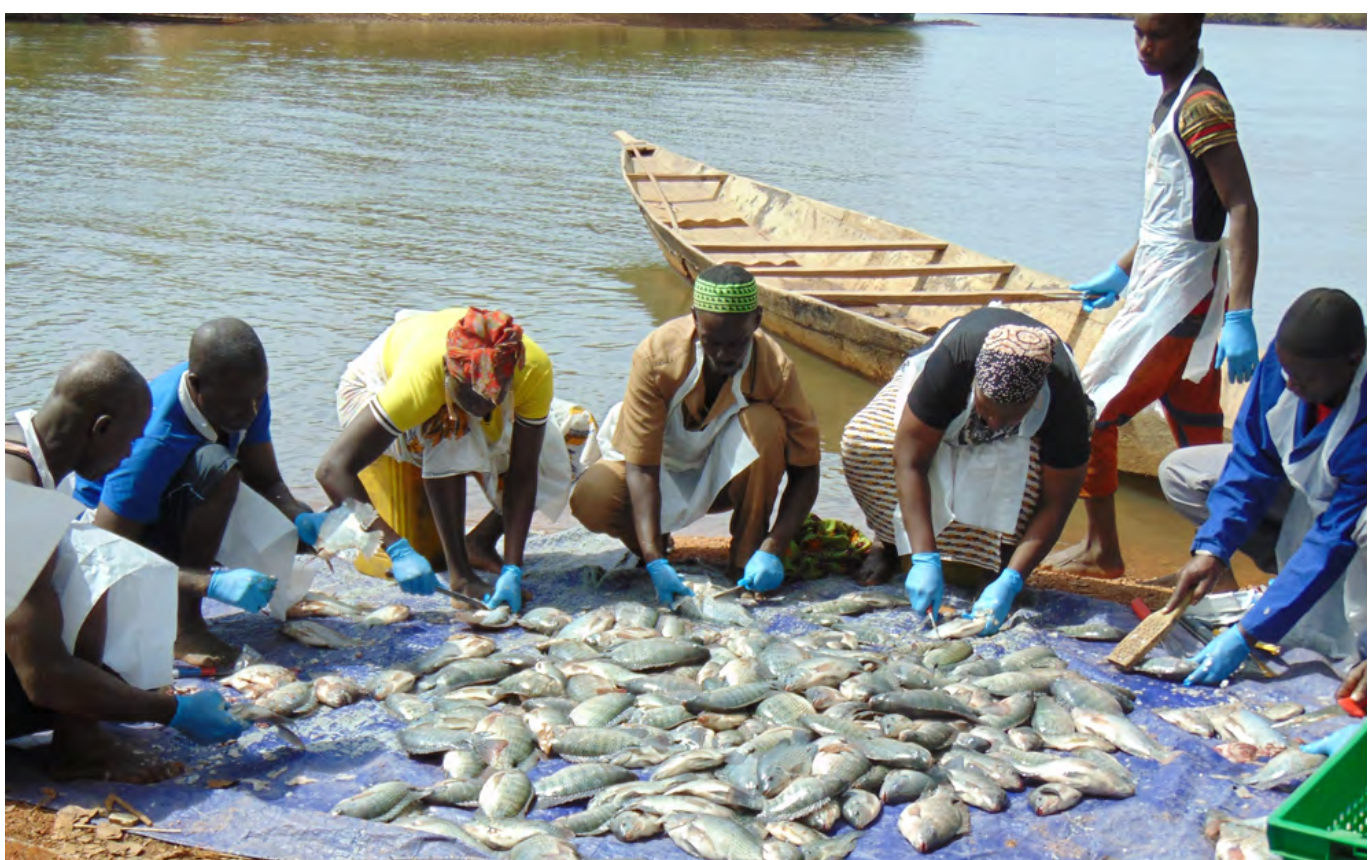
Fish farming proje

During 2020, Siguiri made positive progress, evidenced by ongoing positive dialogue and minimal business disruptions. This project, due to begin in 2021, is scheduled to have completed the ASM formalisation process and set up the necessary supporting interventions by the end of the first half of 2022. For more information on this, see pages 44 and 59 in the <SR>.