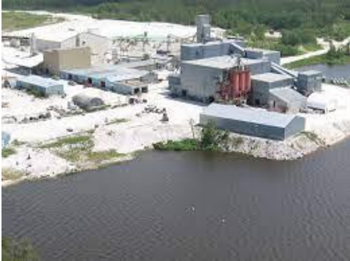
Above: aerial view of the Tanco Mine at Bernic Lake Manitoba Canada.

The Tantalum Mining Corporation of Canada Limited operates the Tanco Mine located at Bernic Lake in southeastern Manitoba. It was acquired by Sinomine Resource Group Co., Ltd. which is a listed company on the Shenzhen stock exchange and has a market capitalization of approximately 7 billion US dollars. The Tanco Mine has operated since 1968 with operations focused on mining the world famous Tanco pegmatite which is one of the most evolved lithium bearing pegmatites known globally. In previous years tantalum and cesium formate have been produced at the mine. Tanco currently employs approximately 150 workers most of whom are residents of southeastern Manitoba.