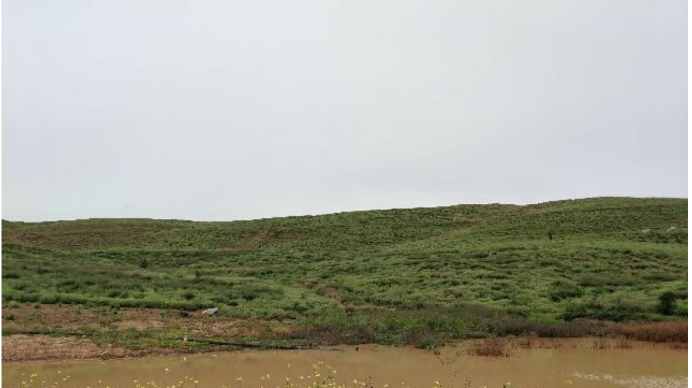
Figure 8: VD5 natural landform design showing FY18-FY20 rehabilitation. Image collected in April 2020 following rainfall.

Drought impacted the first half of the reporting period limiting revegetation efforts. Significant rainfall was received on site in the second half of the reporting period increasing vegetation cover (see Figure 7 and Figure 8 for comparison). This has helped to stabilise the landform but will need intense weed treatment in the short term to keep on track.