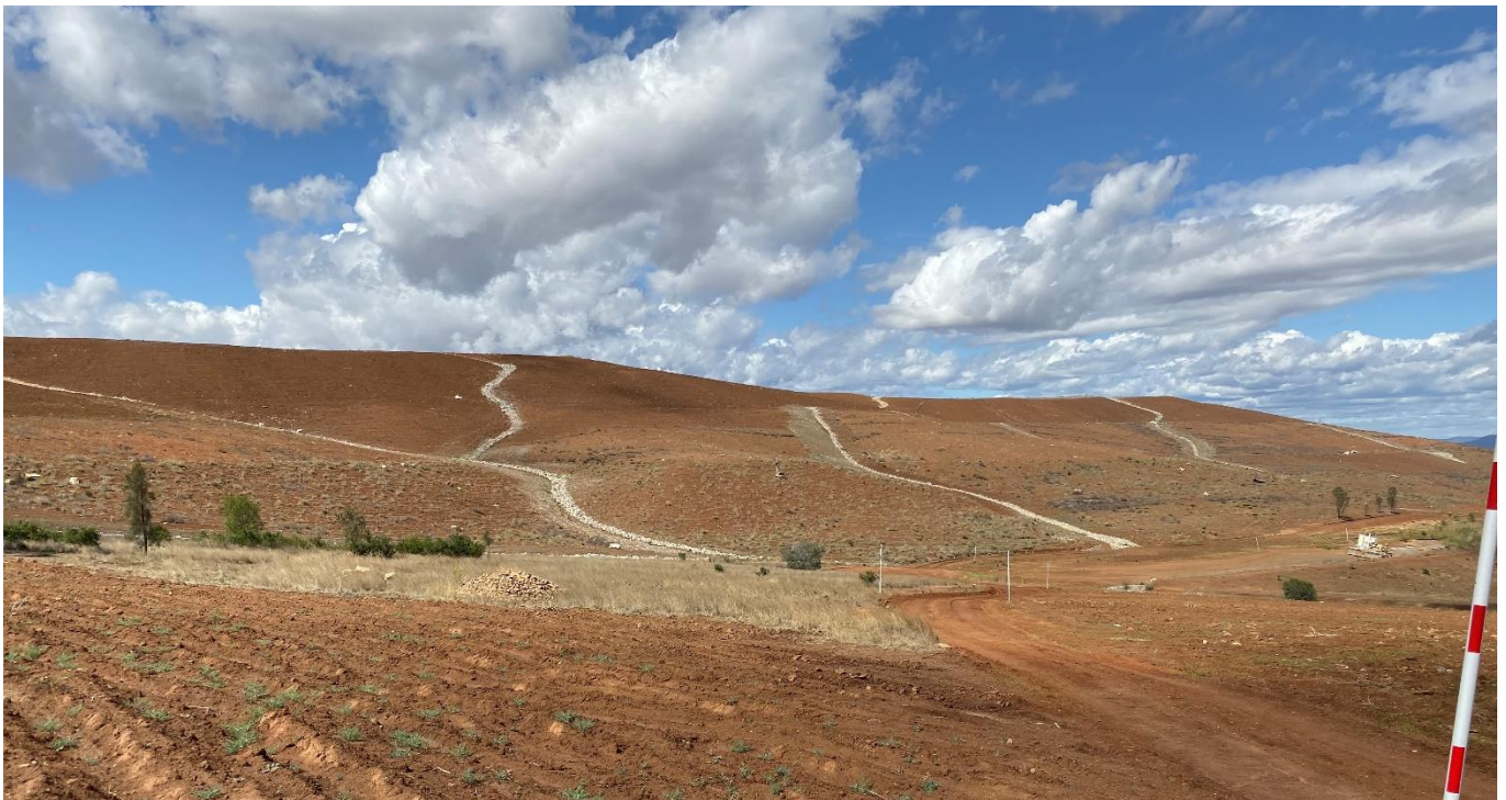
Figure 7: VD5 natural landform design showing FY18-FY20 rehabilitation. Image collected in November 2019 prior to rainfall.

Further improvement works can be found in Table 33, as recommended in various consultant reports for the site.