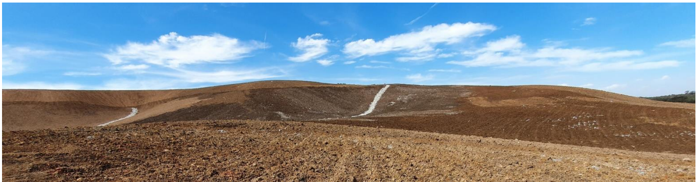
Figure 6: Rehabilitation at Saddlers Central emplacement using natural landform design

The MAC-ENC-MTP-047 Rehabilitation Strategy with updated designs was submitted to the former DP&E and former DRG in 2018 with updated information in relation to the design use and void management.