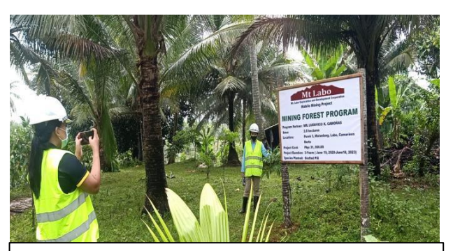
MMT Monitoring at Mt.Labo on September 28, 2022

Additional information related to the Mabilo Project may be found on the TVIRD website at <a href="https://tvird.com.ph/">https://tvird.com.ph/</a>.