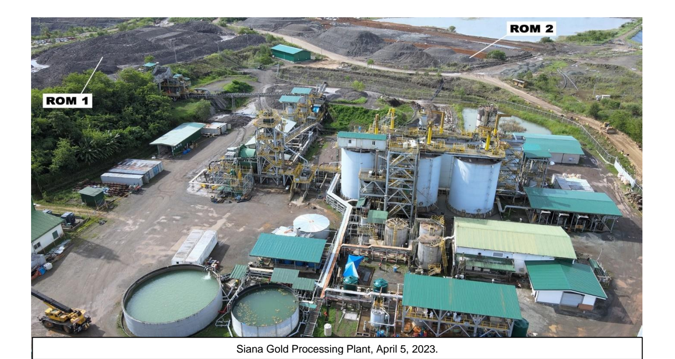
TVI Pacific Inc. Page 16 of 47 December 31, 2022

Prior to the acquisition by TVIRD, GRC was the Philippines affiliate of Red 5 Limited ("Red 5") (ASX: RED), a Perth, Western Australian-based gold company, the shares of which are listed on the ASX.