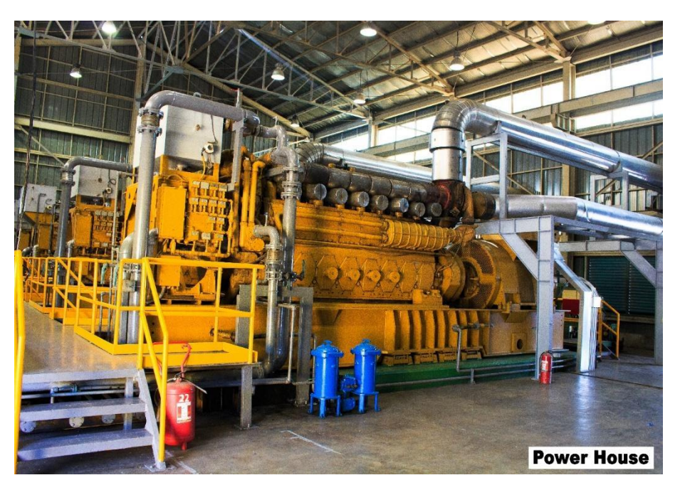
Siana Gold Power House, April 5, 2023