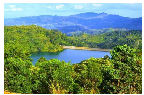
Canatuan Tailings Storage Facility - November 2012.