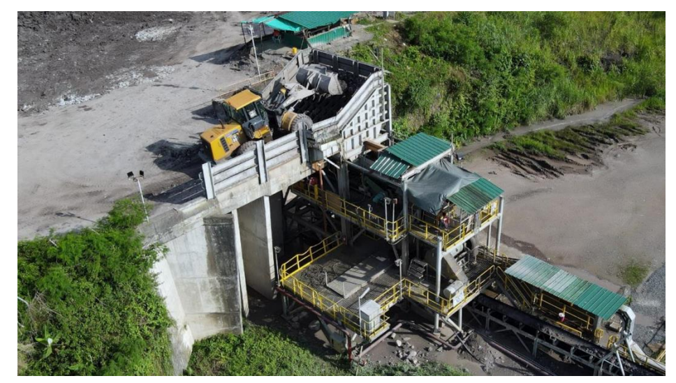
Siana Gold Crushing Circuit, April 5, 2023.