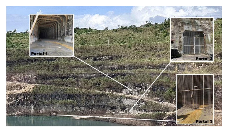
Current underground portals at Siana, April 2023, including Main Access, Exhaust Way and Return/Escape Way.

Red 5 announced on February 23, 2016 that Mining One Pty Ltd had completed a JORC 2012 underground mineral resource and reserves estimate using a 2.4 g/t gold cut-off that was then subsequently reviewed annually by Red 5 and most recently confirmed in their Annual Report at June 30, 2021.