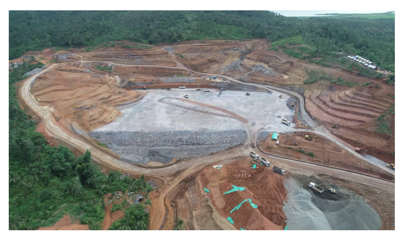
TSF6 embankment on October 3, 2022.

Red 5 has previously published underground and open pit mineral resource and mineral reserve estimates for Siana and mineral resource estimates for Mapawa. These estimates, detailed below, were prepared using the Australasian Code for Reporting of Exploration Results, Mineral Resources and Ore Reserves (the "JORC Code" or "JORC 2012"). No estimates for either Siana or Mapawa have been prepared using the 2014 definition standards published by the Canadian Institute of Mining Metallurgy and Petroleum ("CIM 2014 Standard") and no technical report supporting this estimate has been prepared in accordance with NI 43-101. A "qualified person" (as defined in NI 43-101) has not done sufficient work to classify any of these mineral resource or mineral reserve estimates as current. As a result, the Company is treating the following estimates as historical in nature and not current mineral resources or mineral reserves, and they should not be relied upon. There are certain differences between the JORC Code and the CIM 2014 Standard described further below.