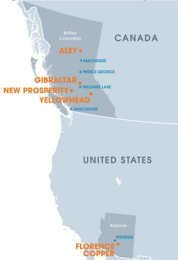
Figure 1: Location of Taseko's Properties

The map below highlights the location of our mineral properties: