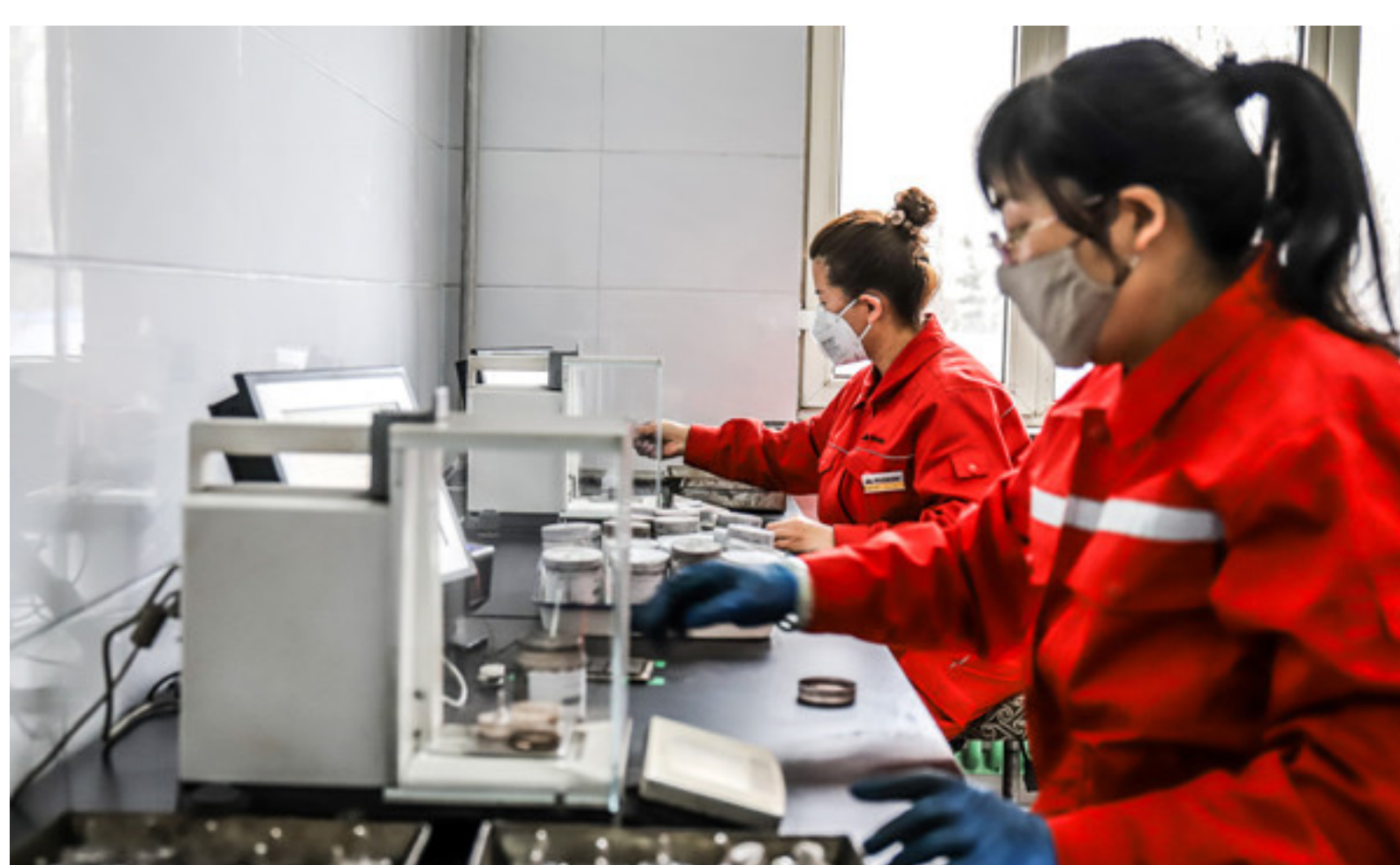
Laboratory technicians at Jungar Energy Group test the quality of the coal at the coal preparation plant.