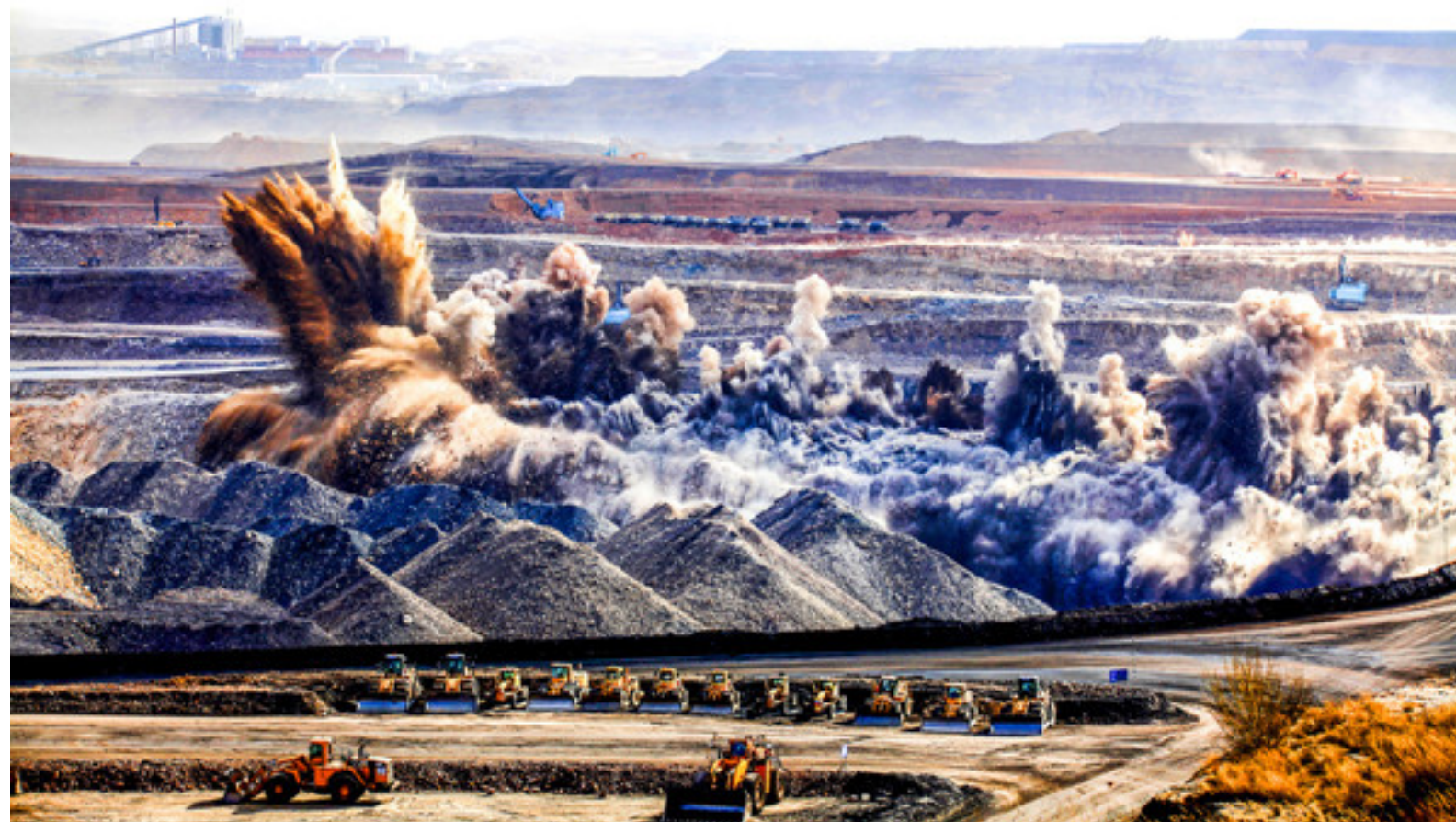
A pin-point blasting at the open pit site