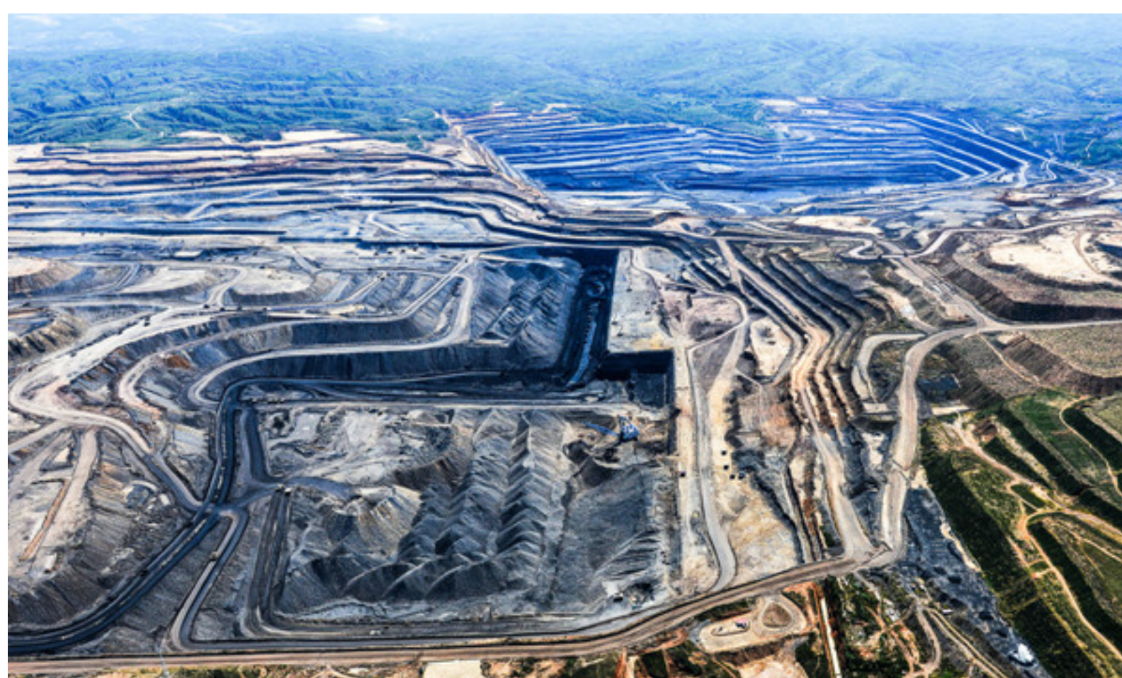
An aerial view of Zhunneng Group Company Limited's open pit

The 448-kilometer Datong-Jungar Railway and the Jungar-Chinan Railway that can transport more than 100 million tons of products, as well as supportive facilities to supply power, water and explosives are also among the company's assets.