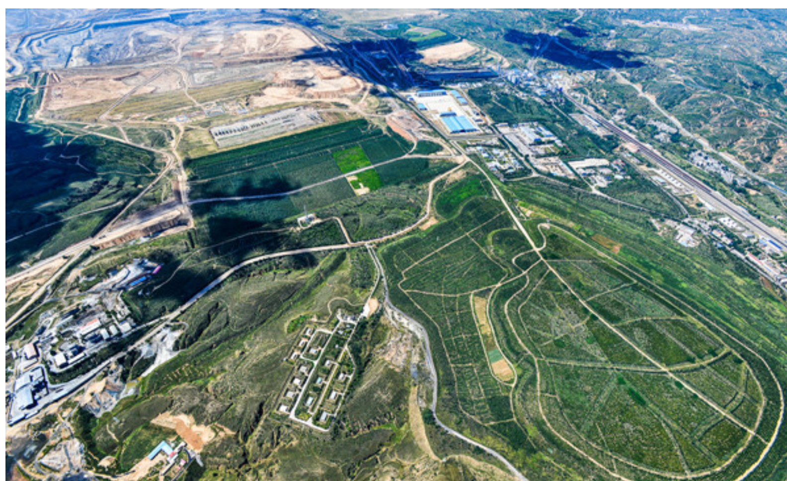
An aerial view of Jungar Energy Group's mining area after greening and reclamation