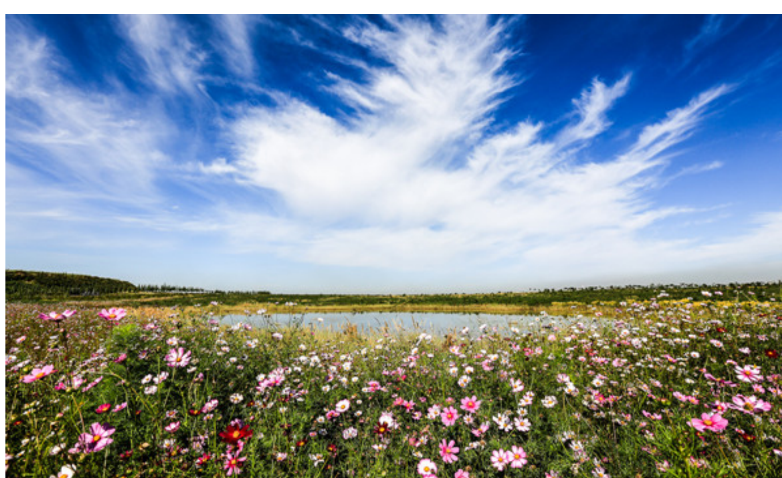
A view of a man-made lake at the waste dump of the open pit