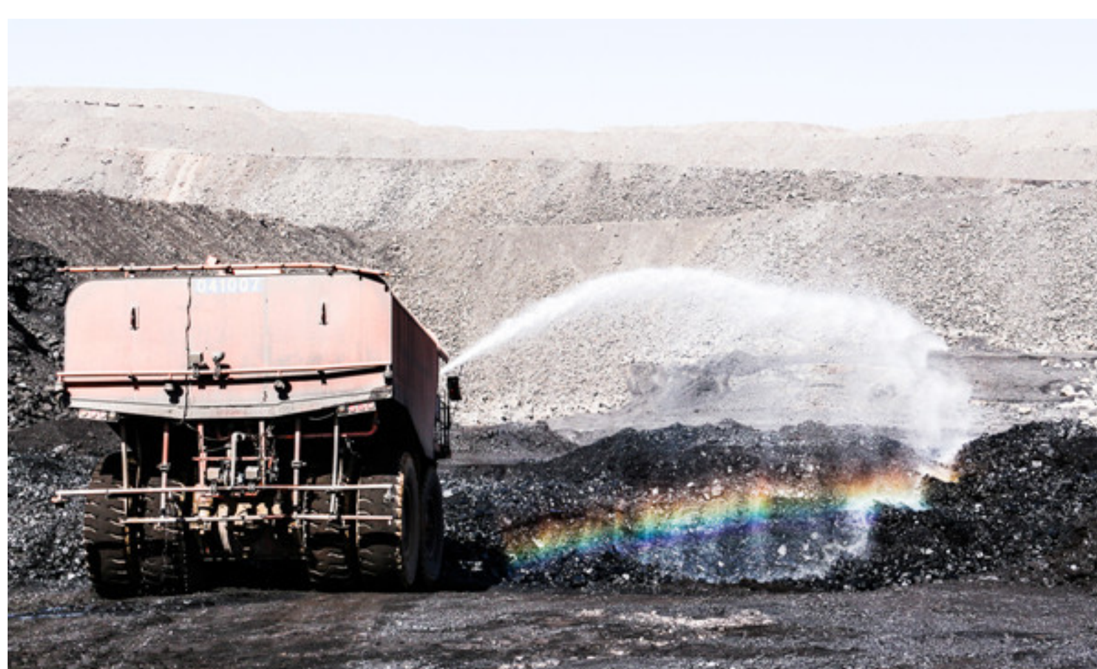
A sprinkler at work in the mining area