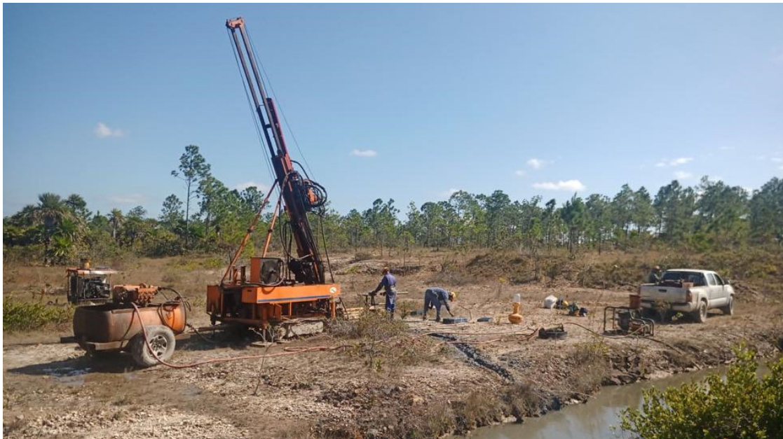
Drilling - El Pilar