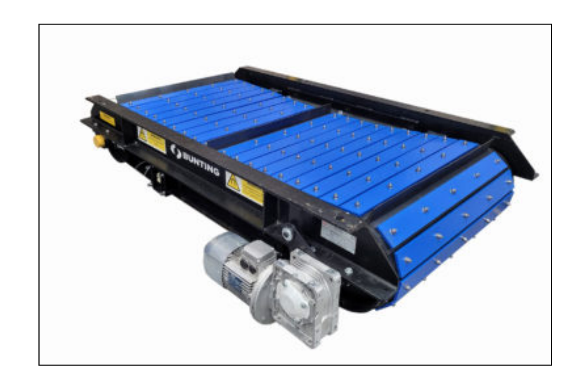
Bunting offers up armour for Overband Magnet applications