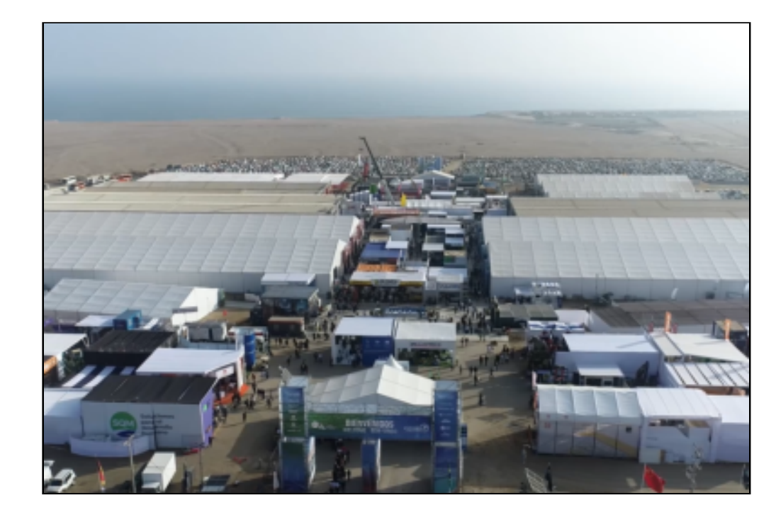
EXPONOR 2024 – eyes of the world were again on the Antofagasta region