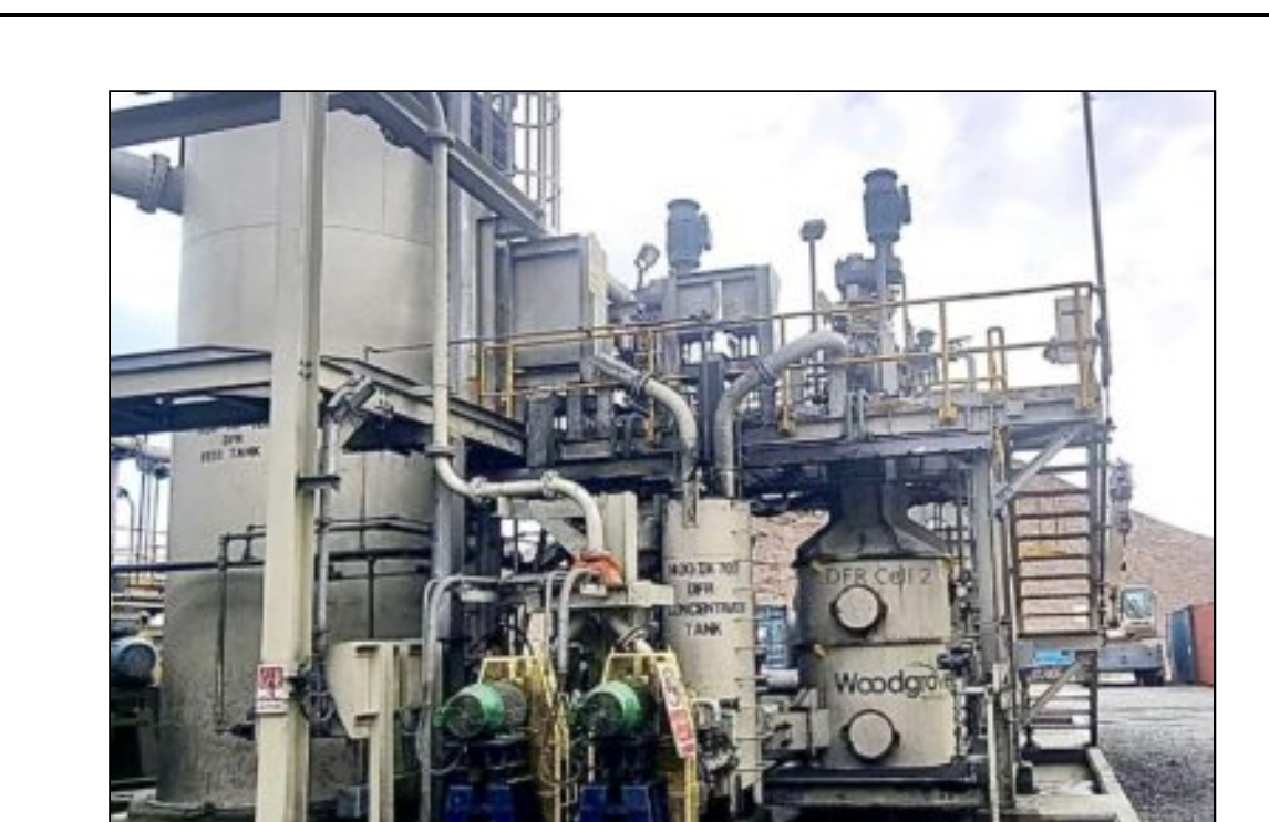
Barrick deploys Woodgrove DFR flotation technology for Jabal Sayid Lode 1 project