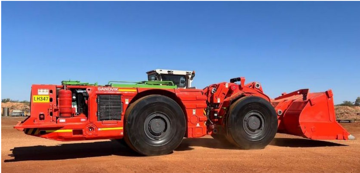
Figure 1: Sandvik underground loader (LH517i) arriving on site.