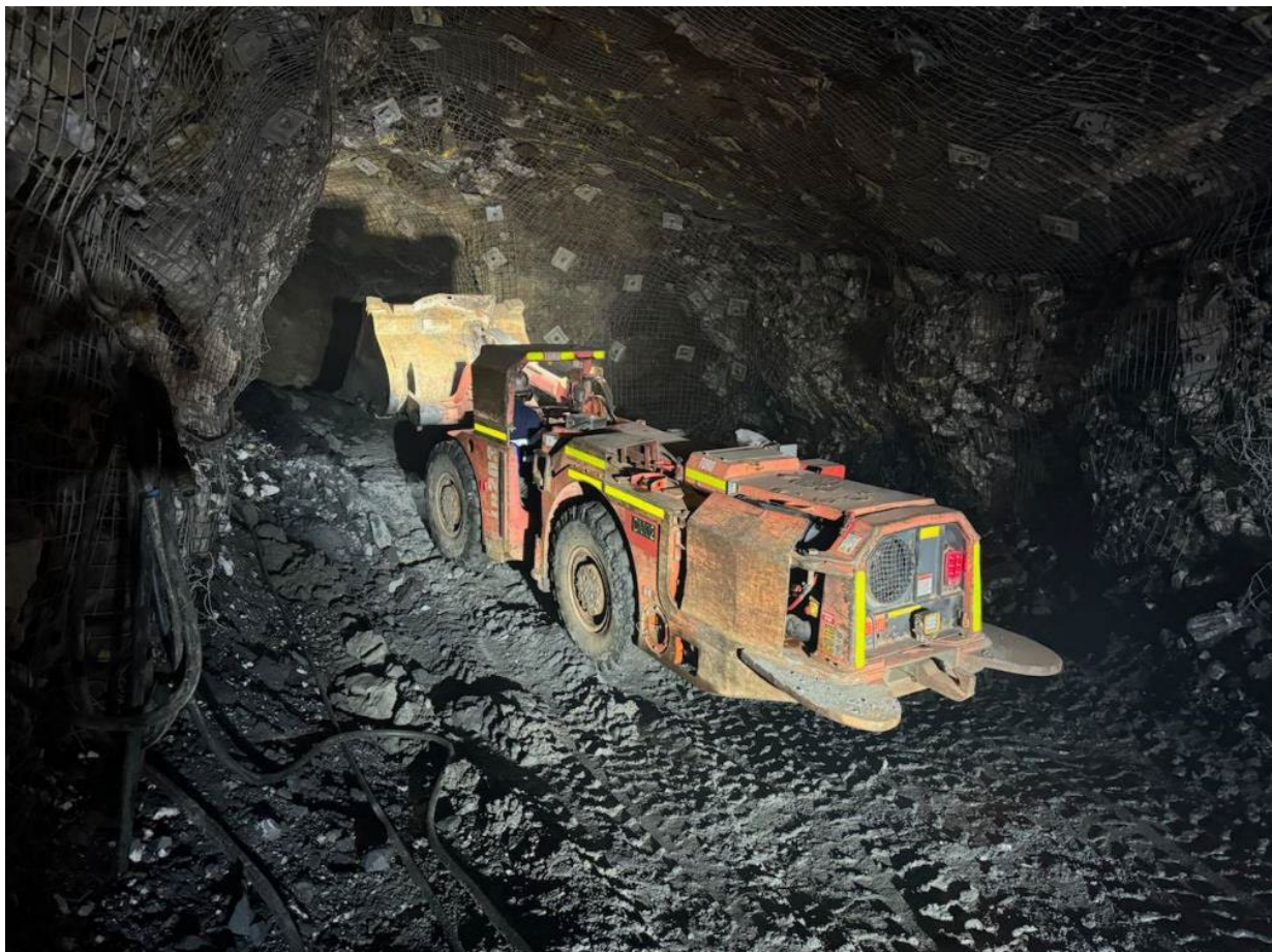
Figure 2: Cream Mining loader cleaning development headings at Paulsens underground.