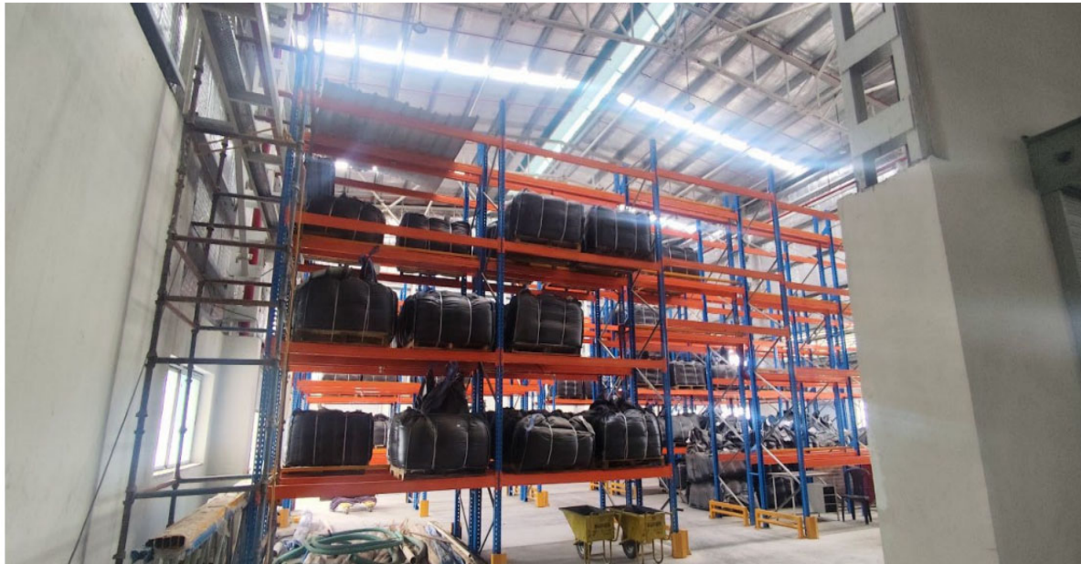
Figure 3 –The JV's inventory of graphite concentrate ready for treatment and produced expandable graphite for shipment

The present market conditions for the sale of expandable graphite are favourable given China's reduction in exports, and this provides an immense prospect to the JV who are amid concluding sales and pricing terms with existing buyers.