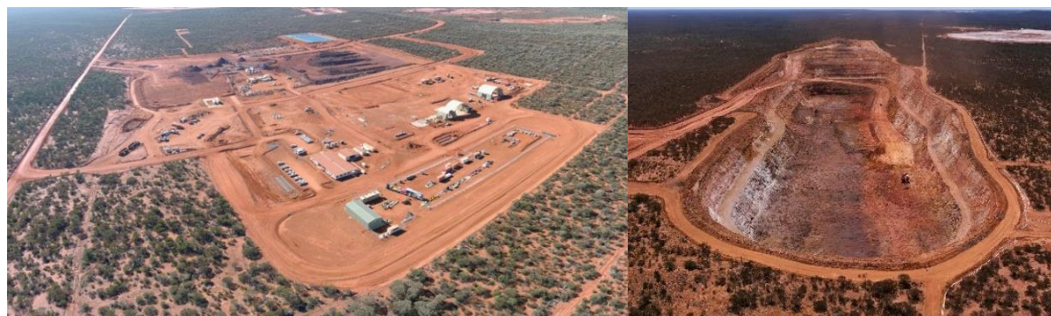
Shine Iron Ore Mine

“Fenix is committed to unlocking value from the abundant valuable resources of the Mid-West and the obvious place to start is with the resources that we own and control.”