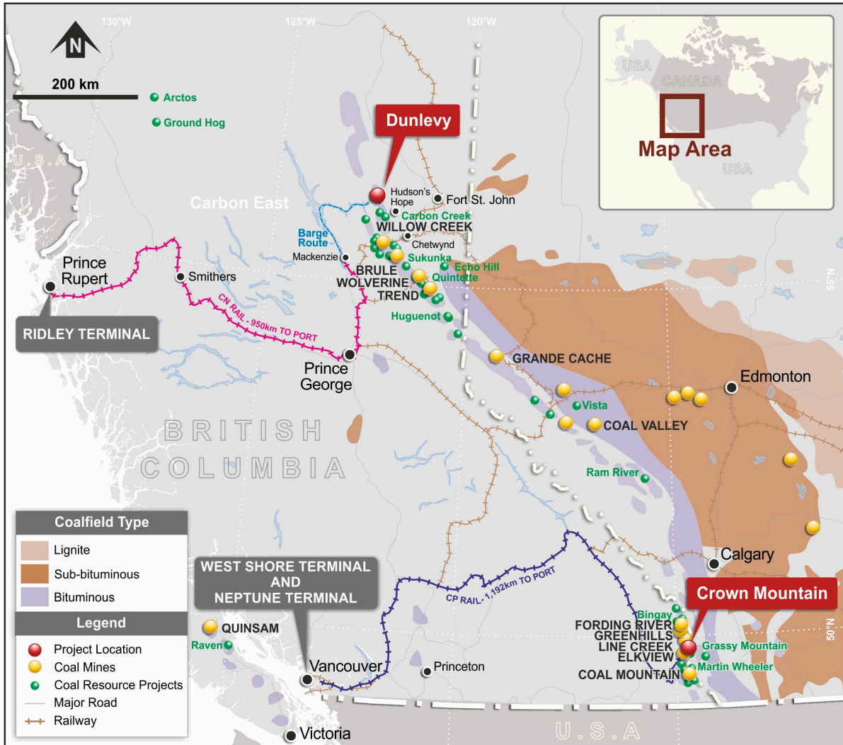
Figure 1 – Project Location Plan

The Company’s two projects are located in British Columbia, Canada which are shown in Figure 1 Location Plan below.