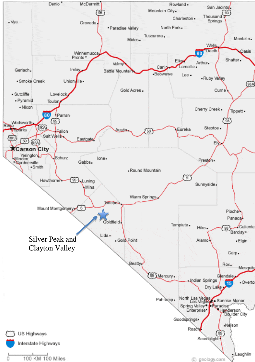
Figure 1: Clayton Valley Project Location Map

Under the Agreement, SLB has the obligation to maintain all 950 claims in good standing with the BLM and with Esmeralda County, and is current in its filings.