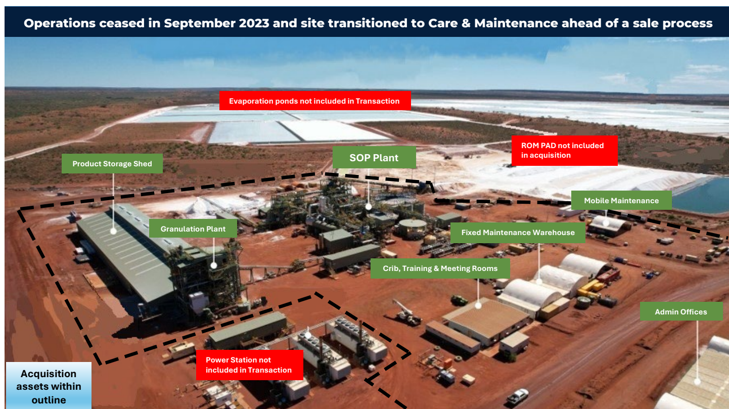
Figure 1 – Photograph of the Beyondie Potash Project in 2023 when operated by Kalium. The Transaction comprises a fully constructed processing plant, site offices and maintenance infrastructure. Specific plant components include, KTMS crushing circuit, Kainite conversion circuit, column flotation circuit, liquor cooling heat exchangers, evaporative cooling circuit, product separation centrifuges, SOP recovery and granulation units, RO water plant and a bulk storage shed.

The Company notes that the Transaction does not include acquisition of the power station, gas or brine supply facilities, evaporation ponds, accommodation camp and some other minor items of the greater Beyondie Potash Project (See figures 1 & 2 below).