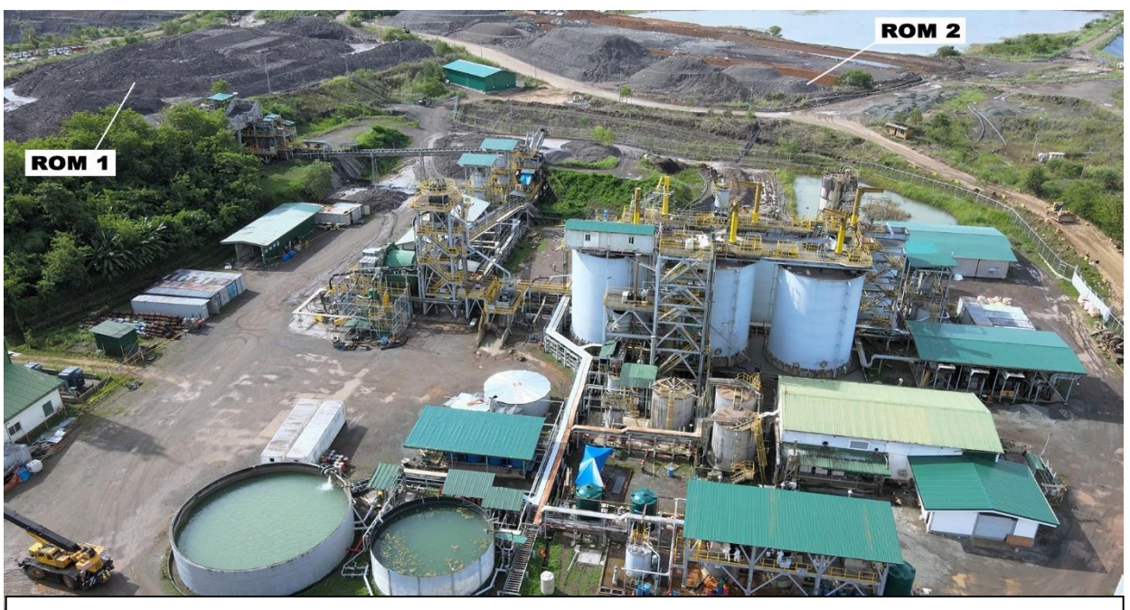
Siana Gold Processing Plant, April 5, 2023.