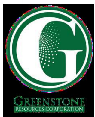
Greenstone Resources Corporation a 100%-owned TVIRD entity

TVIRD owns 100% of Siana through its 100%-owned subsidiary, GRC. The mine covers a 3,289 hectares ("ha") MPSA (MPSA No. 184-2002-XIII) in addition to 100% of the neighboring 1,482 ha MPSA No. 280-2009-XIII for the Mapawa Project and the Ferrer Claim (as covered by the Application for Mineral Production Sharing Agreement No. A000046 and comprising of one Block of 595 ha). The Siana MPSA was granted on December 11, 2002, and registered with the Philippine Mines and Geoscience Bureau ("MGB") on December 27, 2002, for a term of 25 years.