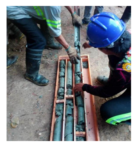
Drill core logging activities at PDA February 2024

Drill rigs were mobilized to PDA in October 2023 with the expectation to conduct resource drilling for 60 days. The purpose of the drilling program is to validate and extend the deposit's earlier findings of pyrite mineralization. The mineralization contains some copper, zinc, gold and silver as well. The program is being performed by TVIRD's 100%-owned EDCO. A total of 31 proposed exploration drillholes (3,040 meters) and redrilling of 3 old drillholes (240 meters) for metallurgical study are planned for a total meterage of 3,280 meters. To the date of this news release, a total of 1,548 meters has been drilled and includes the completion of 14 new drillholes, the redrilling of 2 holes and the premature termination of 3 drillholes following the receipt on March 4, 2024, of a CDO issued by the Iloilo provincial government. Until the CDO is resolved, drilling and field operations have been suspended and the exploration team has turned its focus to drill core logging while EDCO has demobilized all rigs. Approximately half of the core samples have been prepared for transport and submission to the Balabag fire assay laboratory.