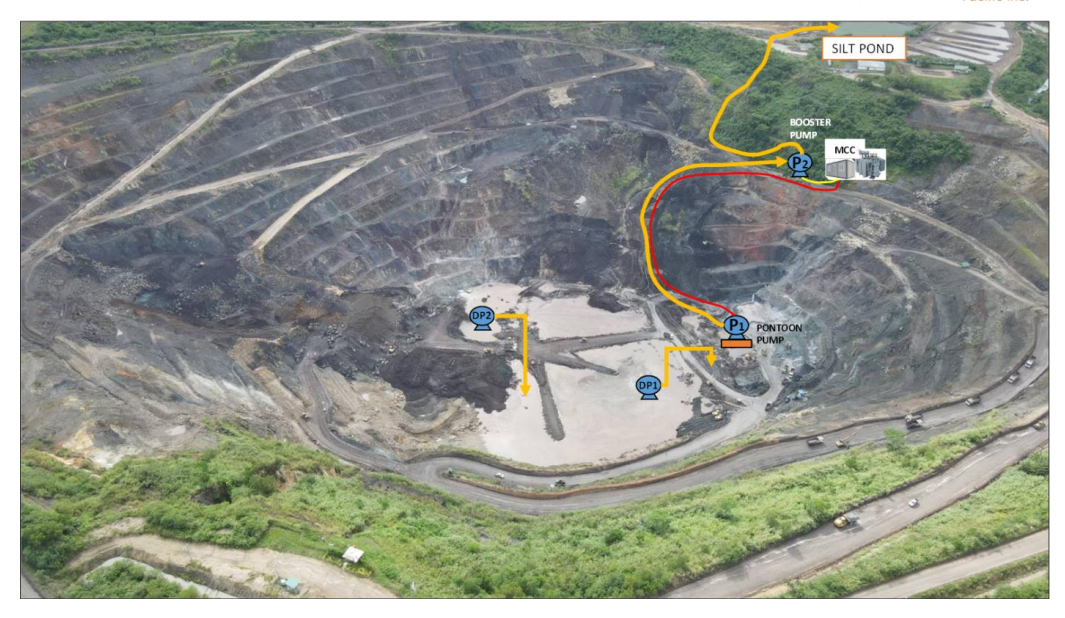
View of Siana open-pit mine and pit bottom recommended pump set-up - April 16, 2024