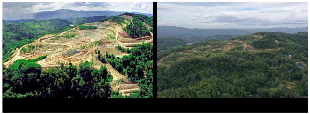
Canatuan Mine site prior to 2015.

As at the effective date of this MD&A, Canatuan is continuing its final rehabilitation activities under the supervision of the Multi-Partite Monitoring Team ("MMT") that includes representatives of the local community, the municipal and provincial government, and the Department of Environment and Natural Resources ("DENR") (as representatives of the national government).