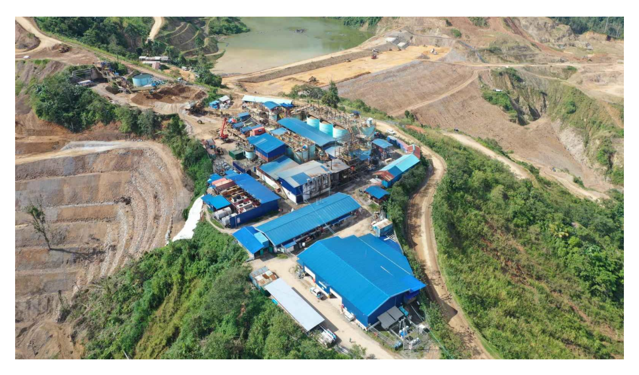
Balabag Processing Plant on February 23, 2023.

The cash cost per ounce for the three months ended March 31, 2024, was US $1,296 per AuEq oz (twelve (12) months ended December 31, 2023, was US $1,444 per AuEq oz / twelve (12) months ended December 31, 2022, was US $1,187 per AuEq oz) and the All-in Cost averaged for the three months ended March 31, 2024, was US $1,638 per AuEq oz (twelve (12) months ended December 31, 2023, was US $1,901 AuEq oz / twelve (12) months ended December 31, 2022, was US $1,543 AuEq oz).