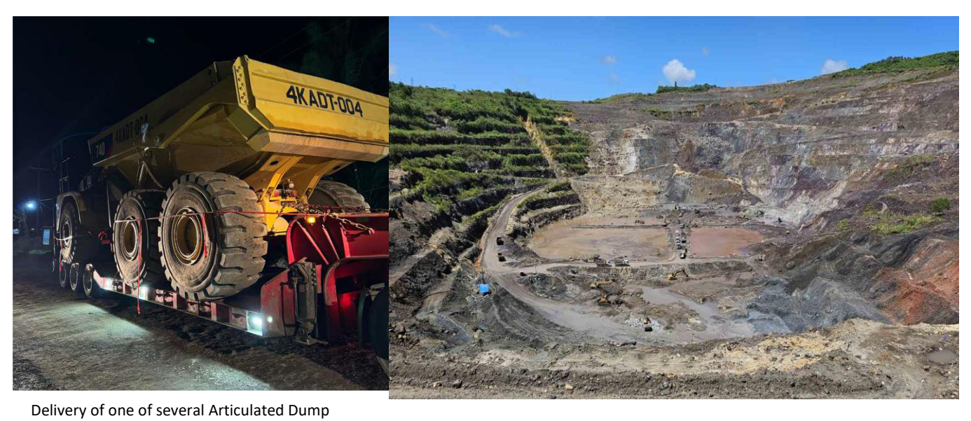
Trucks (ADT) to Siana Gold Mine in preparation for increased mining activity.