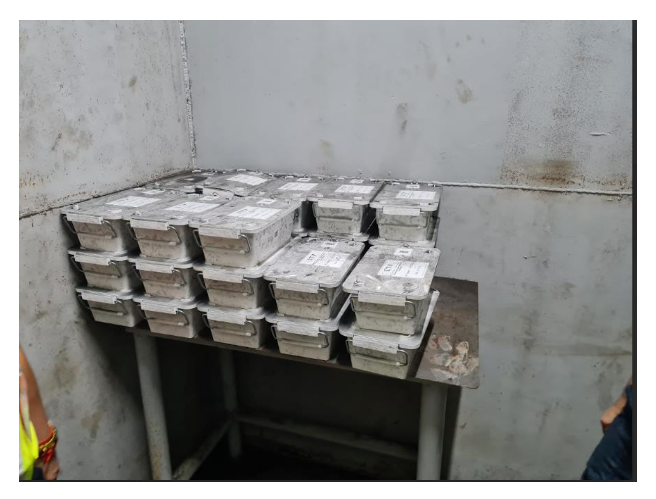
Dore boxes in Balabag Gold & Silver Project gold room awaiting pickup (July 26, 2024)

The average processing rate at the Balabag gold processing plant in the six (6) months ended June 30, 2024, was 2,112 t/d while plant availability was 91%. Head grades for the six (6) months ended June 30, 2024, averaged 1.6 g/t Au and 35.31 g/t Ag with recoveries at 94% for Au and 78% for Ag.