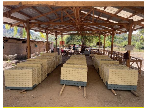
Core boxes stacked at Looc core logging area Pan de Azucar, May 6, 2024

In October 2023, TVIRD, through its wholly owned subsidiary EDCO, initiated a 60-day resource drilling program to validate and expand the known pyrite mineralization, which also includes copper, zinc, gold, and silver. The planned program included 31 new exploration drillholes totaling 3,040 meters and the redrilling of 3 old drillholes for 240 meters for metallurgical studies, aiming for a combined drilling of 3,280 meters. As of the writing of this MD&A, 1,548 meters have been drilled, comprising 15 new drillholes and the redrilling of 2. However, drilling activities were halted prematurely due to a Cease-and-Desist Order (CDO) issued by the Iloilo provincial government on March 4, 2024 due to allegation of arsenic contamination. As a result, all drilling and field operations are currently suspended, and the exploration team has shifted focus to logging the drill cores. Half of the core samples were shipped to Siana and Balabag for Au, Ag, Cu, Zn, Fe and S analysis. Results are still pending.