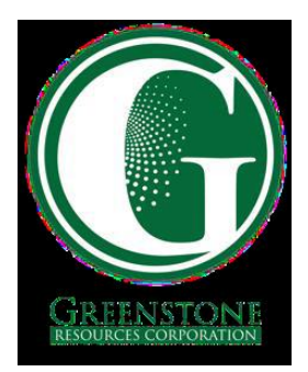
Greenstone Resources Corporation a 100%-owned TVIRD entity

TVIRD owns 100% of Siana through its 100%-owned subsidiary, GRC. The mine covers a 3,289 hectares ("ha") MPSA (MPSA No. 184-2002-XIII) in addition to 100% of the neighboring 1,482 ha MPSA No. 280-2009-XIII for the Mapawa Project and the Ferrer Claim (as covered by the Application for Mineral Production Sharing Agreement No. A000046 and comprising of one Block of 595 ha). The Siana MPSA was granted on December 11, 2002, and registered with the Philippine Mines and Geoscience Bureau ("MGB") on December 27, 2002, for a term of 25 years.