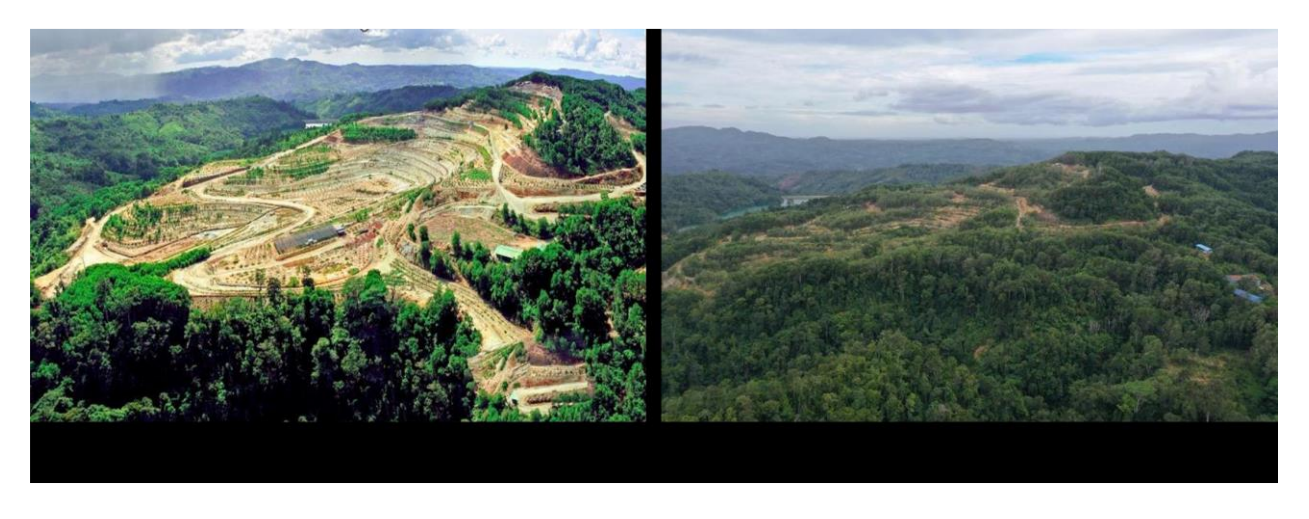
Canatuan Mine (Before Rehabilitation) – 2015.

As of the latest MD&A, final rehabilitation efforts at Canatuan are ongoing, overseen by the Multi-Partite Monitoring Team (MMT). This team comprises representatives from the local community, municipal and provincial governments, and the Department of Environment and Natural Resources (DENR), ensuring that the closure activities meet the highest standards of environmental care.