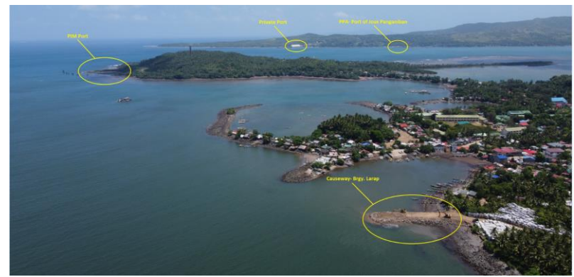
Aerial views of port/ causeway options being considered for the Mabilo Project (April 29, 2024)

The Nalesbitan project, located within the same Mineral Production Sharing Agreement (MPSA) as the Mabilo project, offers TVIRD a 60% indirect interest through its ownership of MLEDC. This MPSA is valid until June 2041. Positioned 15 kilometers west of Mabilo in the historic Paracale Gold District of Eastern Luzon, Nalesbitan is part of a well-known mining region with a rich history of gold mining.