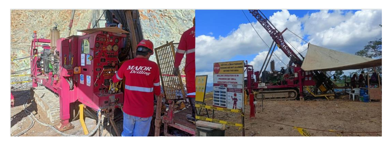
Resource expansion drilling program (July 26, 2024)

TVIRD has completed the Phase 7 and 8 resource drilling programs at Balabag Hill. A total of 91 holes with cumulative meterage of 10,013 were drilled as of July 26, 2024. The drilling program aimed to delineate additional resource at Miswi, Main Tinago and Lalab areas. Almost 50% of the total meterage were focused on defining the down dip extension of the Miswi orebody. The deepest hole targeting the Lalab deepseated veins reached 499 meters from surface. Overall, the average drilling depth is 100 meters. The resource drilling program commenced in February 2024 with EDCO and Major as the drilling contractors.